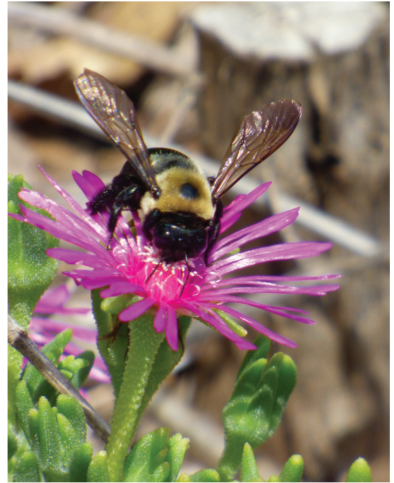
Carpenter bee on ice plant

Large carpenter bees have a black body with either light or dark hairs. The back legs have special hairs for carrying pollen. They are relatively large bees, 0.75 inches long or larger. Large carpenter bees are often mistaken for bumble bees because they are similar in size and appearance. They can be easily identified, however. Bumble bees have a hairy abdomen, while large carpenter bees have a glossy abdomen.