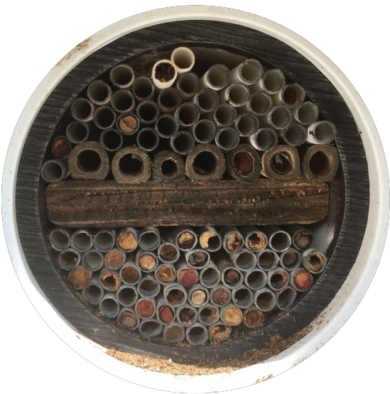
Mason bee paper tubes

Planting pollinator-friendly flowers in your yard is a great first step for improving the quality of pollinator habitats. Adding nesting sites and nesting materials is another important measure in creating sustainable habitats, especially for native bees. Many native bees lay their eggs in aboveground cavities. They make nests in abandoned beetle tunnels in dead logs, hollow stems, and similar locations. Unfortunately, dead wood and debris that would be useful for nesting is often quickly removed from yards. While flowers may be present, the bees are left with few locations and materials for laying their eggs.