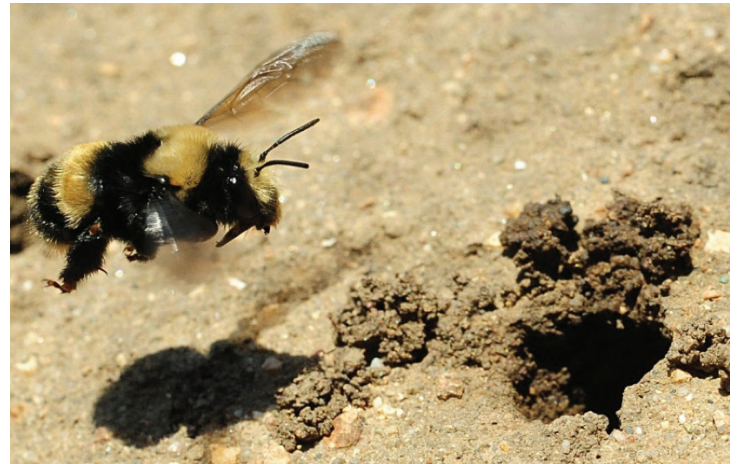
Female digger bee approaching her nest

You can also help to create a pollinator-friendly landscape by planting pollinator-friendly trees, providing lots of flowers, and setting up bird baths or shallow dishes of fresh water.