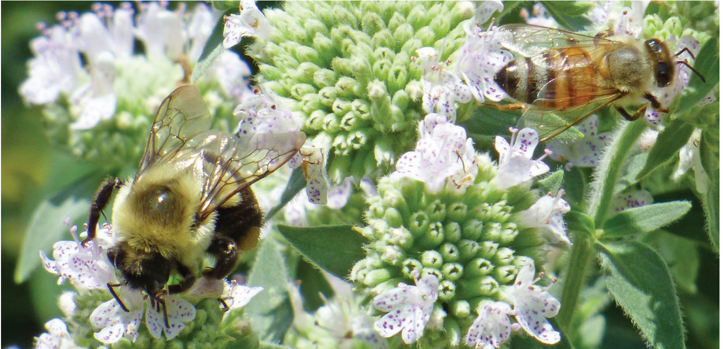
Bumble bee and honey bee on mountain mint

Native pollinators are animals from North America that pollinate crops and many other plants. Pollination is necessary for seed production in many plants. Pollinators include mason bees, carpenter bees, bumble bees, sweat bees, wasps, hover flies, butterflies, hummingbirds, and many more. Most of the focus on pollinators revolves around honey bees, which are native to Europe, Africa, and the Middle East, but not North America, but native bees are very important pollinators. Many native bees are solitary—an individual bee lives alone, rather than nesting in colonies or hives as honey bees do. Also, if left undisturbed, native bees will not sting.