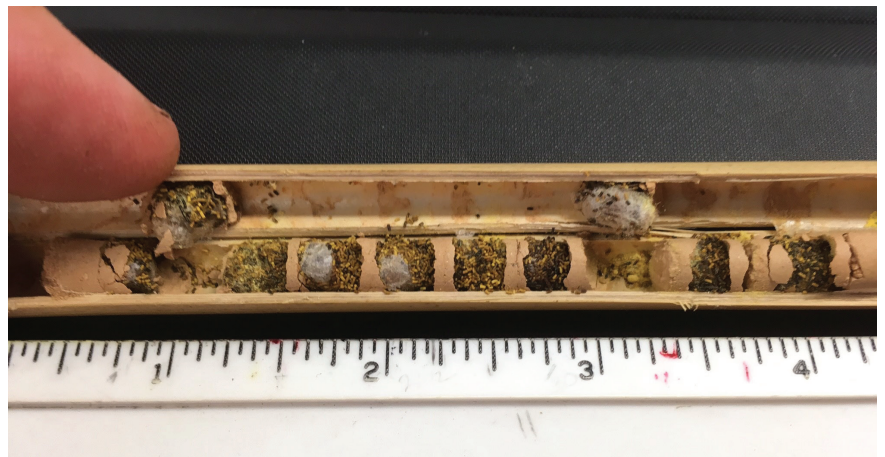
Mason bee nest cells