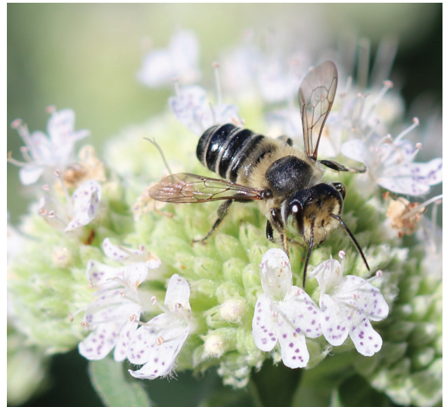
Leafcutter bee on mountain mint

Leafcutter bees are about 0.25 to 0.5 inches long and have black bodies with light or dark hairs. They carry pollen on hairs on the underside of their abdomen. Leafcutter bees have large mouthparts to cut the leaves, but they generally do not bite or sting unless disturbed.