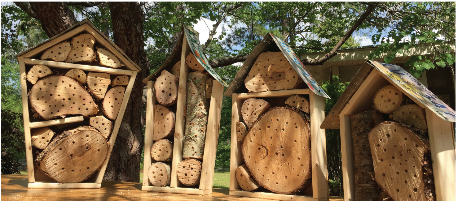
Materials for bee nesting boxes include tree trunk slices and untreated lumber, with license plates acting as roofs

Bees can use different nesting substrates. Aboveground nesting bees use materials like hollow twigs, dead wood, and paper-based bee tubes. These materials can all be incorporated into nesting boxes, or “bee hotels.” Nesting box design can be as simple as several paper-based bee tubes secured into a bundle or one piece of untreated lumber with holes drilled into the surface. Designs can also be creative, using a multilayered structure with numerous types of nesting materials. Creating a variety of cavity sizes will attract different types of pollinators based on their body sizes. The sides of the nesting box that do not contain holes can even be painted to add an attractive splash of color to your yard. Making nesting boxes can be a fun activity for the whole family.