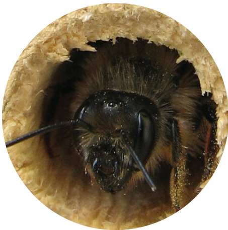
Mason bee

Mason bees are about 0.25 to 0.5 inches long. Some have dark bodies covered with pale hairs, while others are a metallic greenish-blue with less hair.