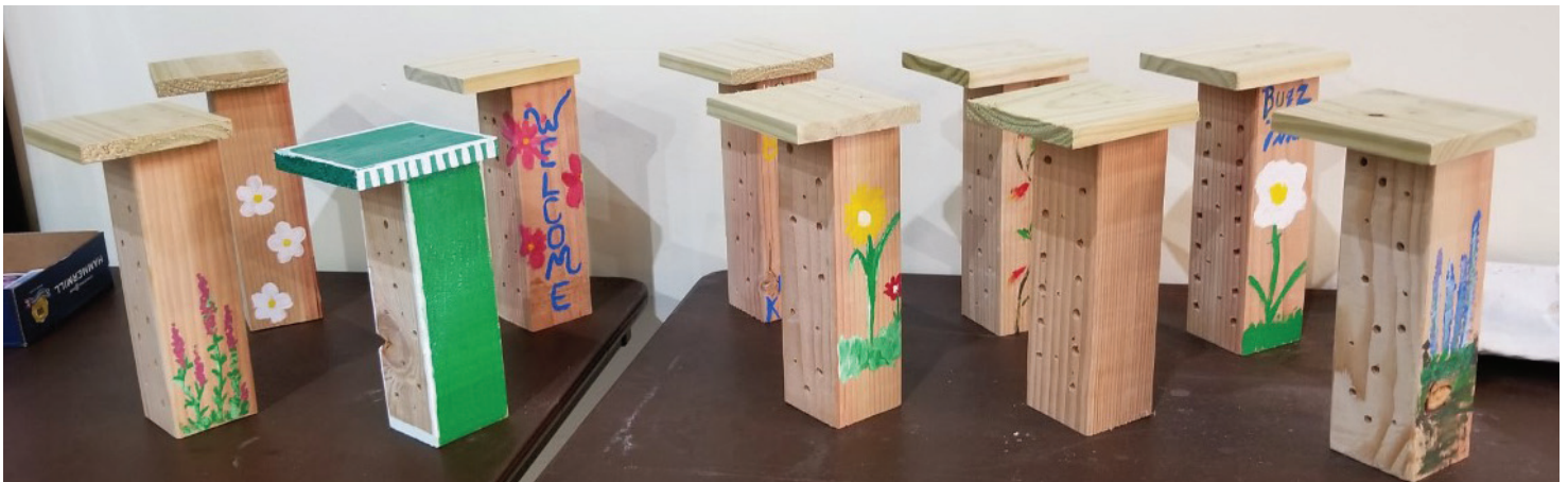
Simple “bee hotels,” constructed from basic carpentry materials