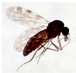
Culicoides cornutus adult biting-midge, showing typical patterned wings and short.

Epizootic hemorrhagic disease (EHD) is caused by a virus that primarily affects white-tailed deer and can also affect mule deer, pronghorn antelope, and rarely cattle. The virus is picked up by tiny Culicoides midges, also known as "no-see-ums" or gnats, when the midges bite an infected host. The midges transmit the virus to another host through a subsequent bite, continuing the disease cycle.