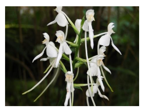
White fringeless orchid (DNR)

■ Proposed – 4 (as threatened): Atlantic pigtoe, black-capped petrel, black rail, trispot darter