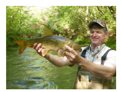
Sicklefin redhorse (DNR)

■ Through another CCA, DNR is working to keep the gopher tortoise , our state reptile, off the Endangered Species list. This includes treating 172,000 acres to restore key habitats across multiple states. In Georgia, the Gopher Tortoise Conservation Initiative has helped increase to nearly 50 the number of protected tortoise populations, an effort covering 43,000 acres – land open to hunters, hikers and others.