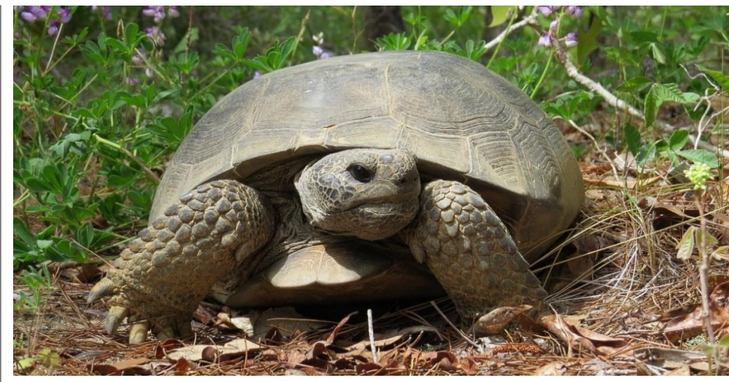
Gopher tortoise (Dirk J. Stevenson)

90-day finding : Evaluation of petition claims. Substantial findings indicate there is enough information to consider listing. "Not substantial" signals no action will be taken. 12-month finding : Following a substantial 90-day finding, the lead agency determines if listing is warranted in this status review. Petition : Formal request to list a species as endangered or threatened under the ESA. Review at agency discretion : Status review undertaken by discretion of USFWS.