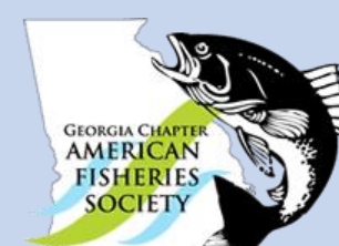
Photo Credits: Duane Raver (USFWS); © Joseph R. Tomelleri (black bass species); Iowa DNR (yellow bass)