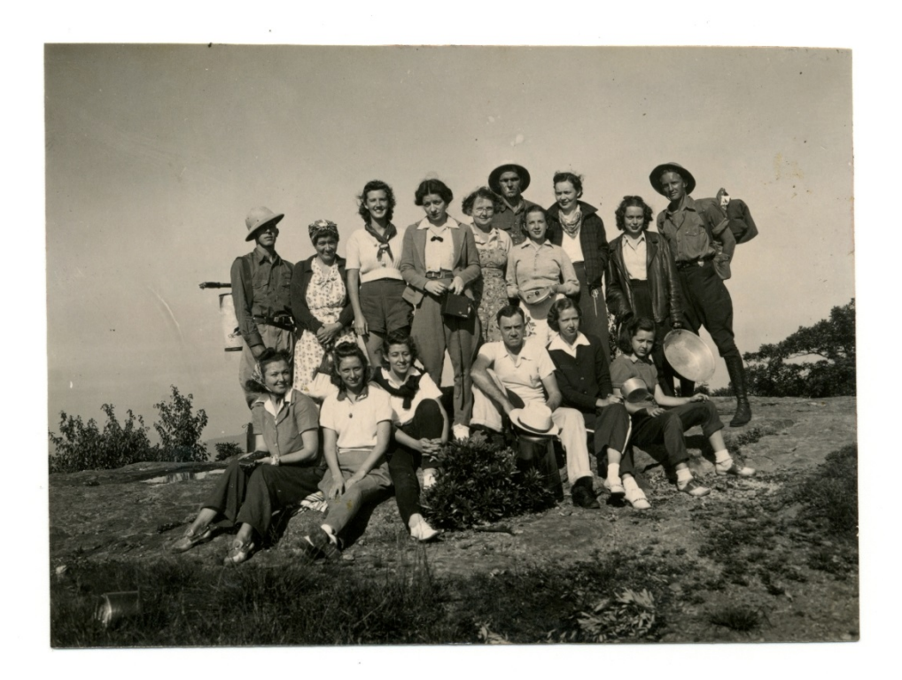
Hikers on Blood Mountain in the 1930's

Vogel State Park, established in 1931, is the second oldest state park in Georgia. Located at 2500 feet above sea level, Vogel sits at the base of Blood Mountain, the highest summit on the Appalachian Trail in Georgia, and is surrounded by Chattahoochee National Forest. The North Georgia Mountains around Vogel were linked to Native American people for generations before European settlement. They were said to be the home of the immortal spirit people known as "Nunnehi," translated as — "the people who live forever." Legend states that the names of Blood Mountain and nearby Slaughter Mountain, have their origins in warfare between competing Cherokee and Creek tribes. Another story tells of treasure placed on Blood Mountain in the days leading up to the infamous Trail of Tears, when Cherokee warriors supposedly buried tribal treasure, including weapons and gold, in a cave on Blood Mountain. Many searches have been made over the years, however, and the location of the hidden treasure, if it ever existed except in the minds of storytellers, remains a mystery. Whether these legends are based in fact, no one knows, but the influence and enduring legacy of Native American culture on the region is without question.