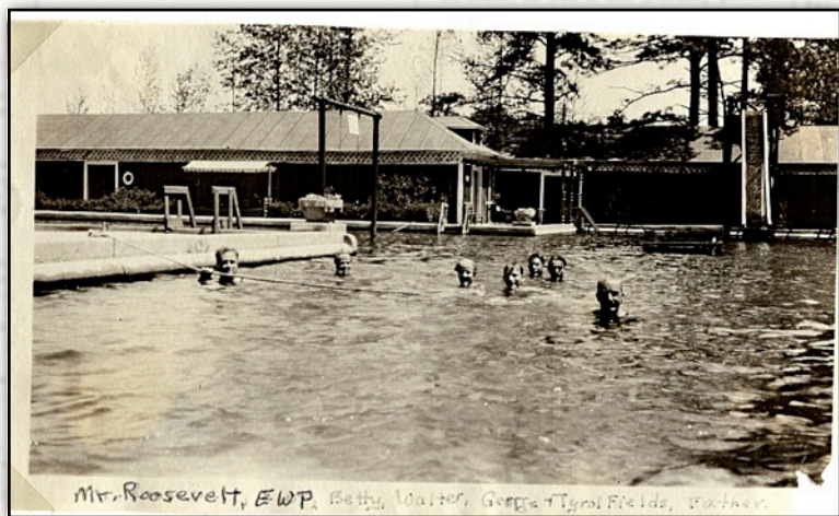
Unexpected arrivals began seeking FDR's therapy in 1925.

Worse than that, it started a flood of correspondence, which hasn't reached its crest yet. I thought I had a good many people writing me letters before that, but since