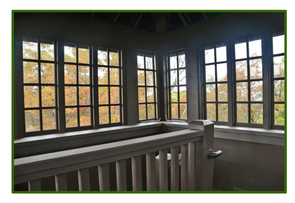
Inside the reconstructed cupola, fall 2015