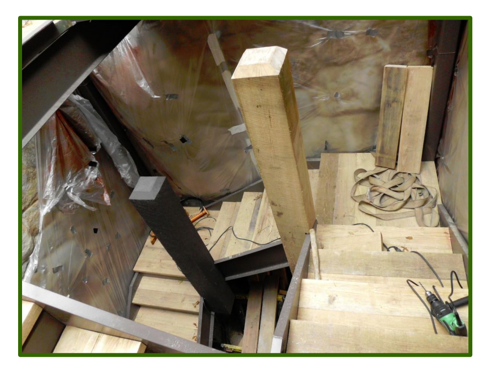
The original steps were cantilevered from the walls, but the modern steps are steel clad in wood.