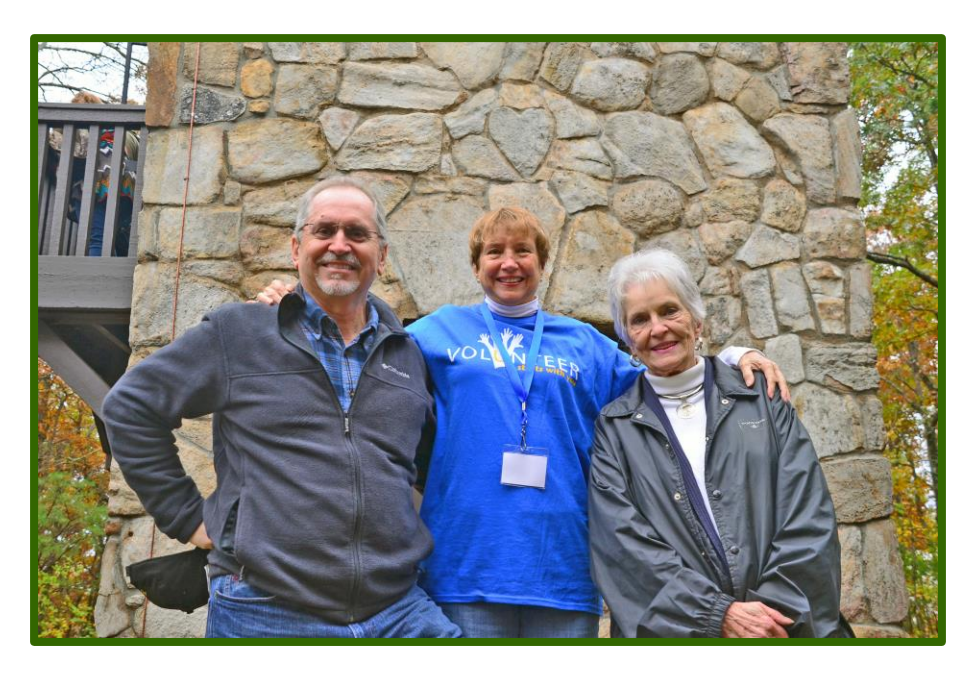
The Bailey children photographed under the iconic heart shaped stone at the ribbon cutting ceremony, fall 2015

Just as those firefighters of a bygone era used the tower to peer into the distance to help protect the vast reaches of North Georgia's mountains, the fire tower is a testament to the nature of humanity itself to build, discover and look ahead into the future.