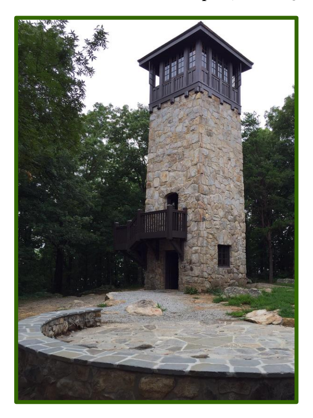
The restored tower and seating area, summer 2015