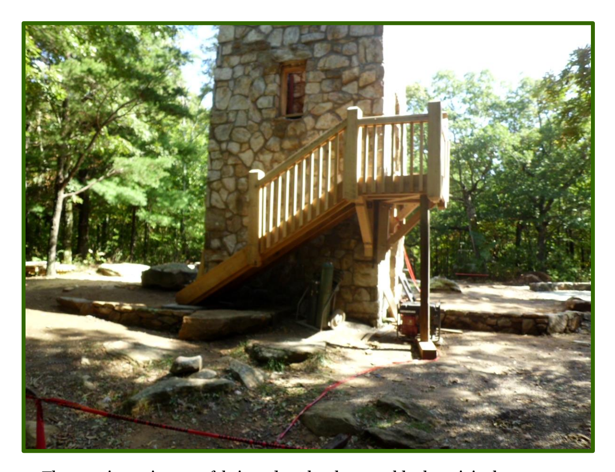
The exterior stairs were fabricated to closely resemble the original entrance.

The tower's most distinctive shape and recognizable image was its unique cupola. Until recently, it was available to view only in pictures more than four decades old. By using the types of wood originally used in the tower, predominately Southern Cypress, the cupola's reconstruction now provides visitors a modern view of the tower's shape.