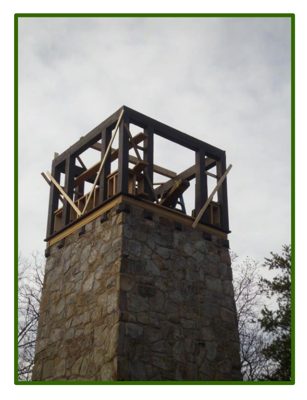
The cupola taking shape, winter 2015