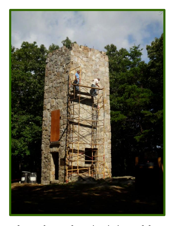
Local stone was used to replace and repair missing and damaged stones on the tower.