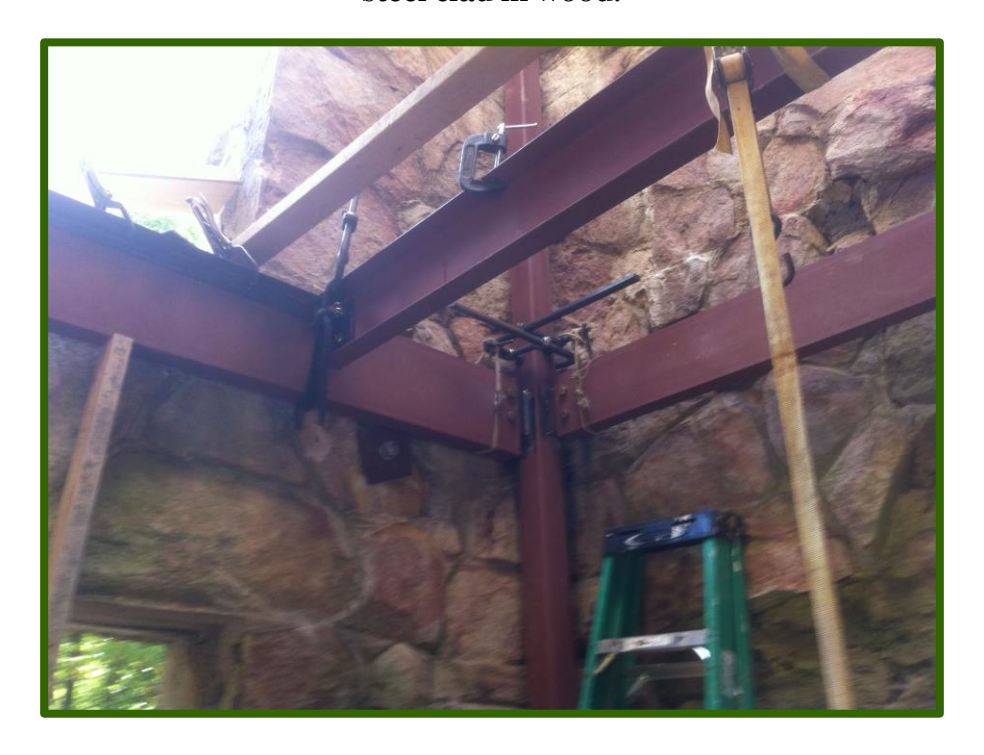
The steel girders are needed to support the weight of the cupola.