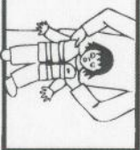
Lift to Test