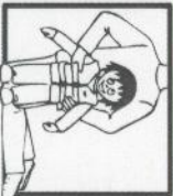
Fasten all Straps