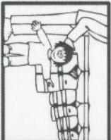
Fit to Size