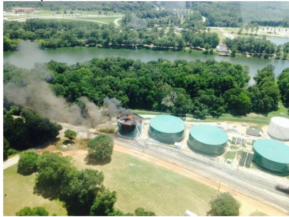
Rangers assisted local law enforcement during this fertilizer tank explosion incident in near the Flint River

On August 19<sup>th</sup>, several Region V Rangers responded to assist Decatur County S.O. and Bainbridge Public Safety after a million gallon fertilizer tank exploded near the Flint River. The incident occurred when a worker was trying to weld on the tank lid. One person was killed in the explosion, and several were injured from the toxic fumes released by the fire.