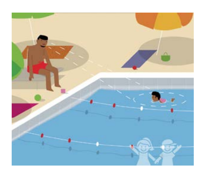
Download Graphic 3