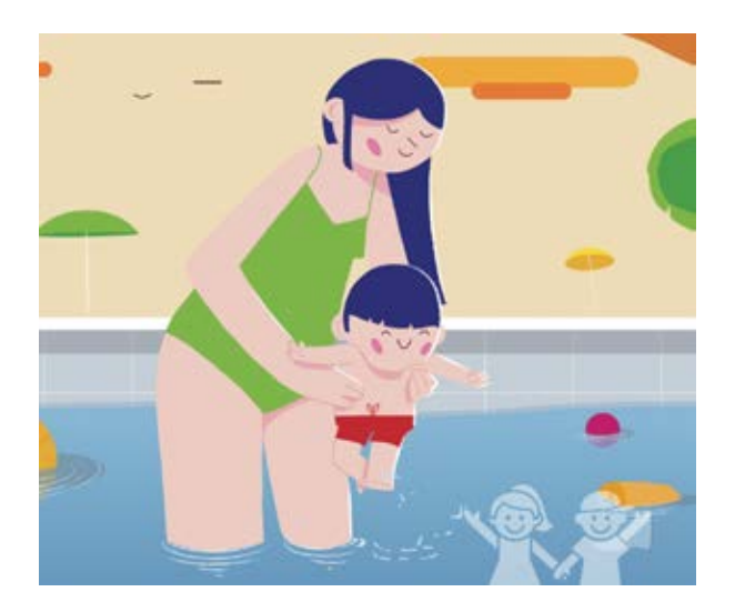
Download Graphic 2