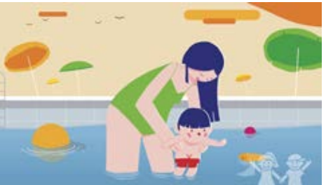
Download GIF 2