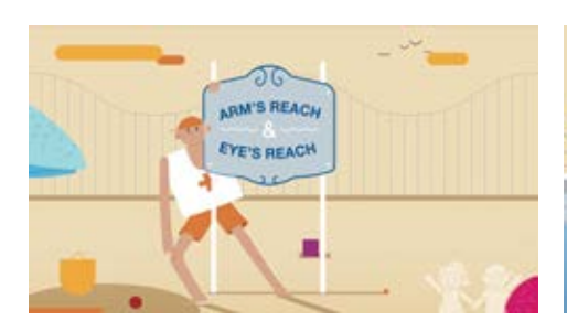
Download GIF 1

GIF 4 Approved Copy: Parents, did you know drowning is the top cause of death for kids ages 1 to 4? Don't let this happen to your little one. Check out these tips from the experts of @Children's Healthcare of Atlanta to keep your kids safe in and around water. choa.org/watersafety