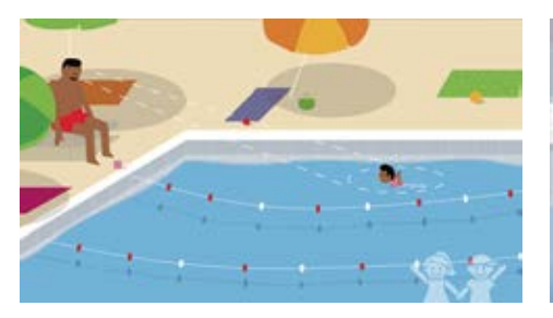
Download GIF 3