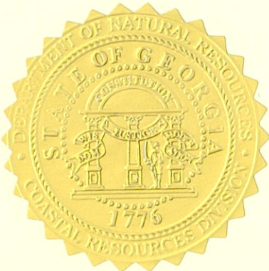
GOVERNOR State of Georgia