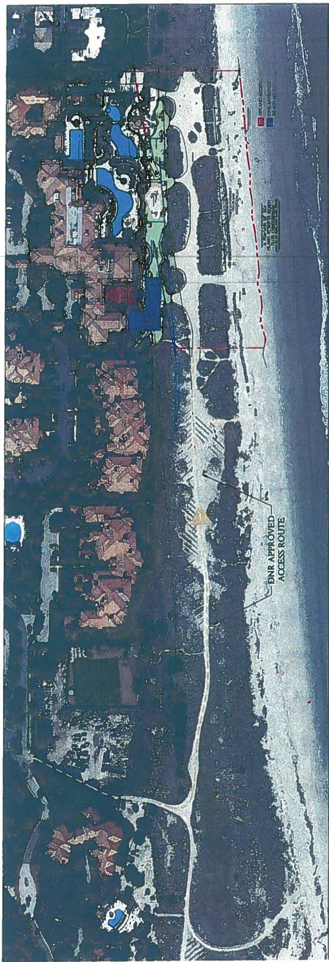
AERIAL TAKEN 3/8/2016

DNR LETTER OF PERMISSION (LOP) EXHIBIT B Sea Island Beach Club