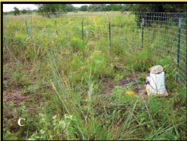
Figure 9. A board is used as a prop on a saloon type door (A). T-posts guide the wire from the prop to the back of the trap (B). The wire is then attached to another wire at the trigger (C). As hogs feed on the bait, the wire is stretched, and the prop pulls from the door.