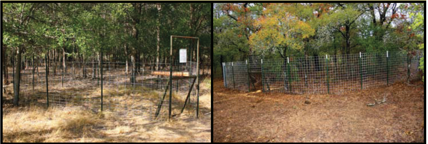
Figure 7. Two different sized corral traps secured with T-posts. Notice both traps are located in wooded areas, providing both concealment and shade.

Once the trap is in the desired shape and location, use T-posts to anchor the trap (Fig. 7). T-posts should be spaced approximately 4' apart. Feral hogs are extremely strong and will test the trap when captured. Do not assume that the trap can be overbuilt. A captured hog can do serious damage to even the sturdiest of traps, and those made of weaker materials may allow hogs to escape altogether. Always make traps as strong as possible.