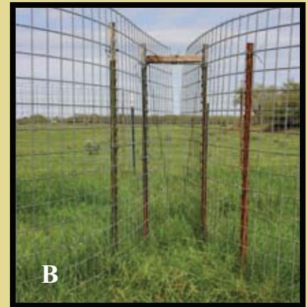
Figure 3. Heart-shaped or Wexford trap. The number of T-posts used depends on trap size and configuration (A). As hogs gather in the chute, they will push their way inside the trap (B).