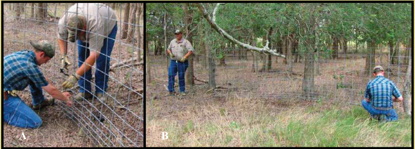
Figure 6. An extra pair of hands is helpful when attaching panels. One person holds the panels in place while the other secures them (A). After all panels are secured, the panels are pulled to their desired location (B).

Once the trap is in the desired shape and location, use T-posts to anchor the trap (Fig. 7). T-posts should be spaced approximately 4' apart. Feral hogs are extremely strong and will test the trap when captured. Do not assume that the trap can be overbuilt. A captured hog can do serious damage to even the sturdiest of traps, and those made of weaker materials may allow hogs to escape altogether. Always make traps as strong as possible.