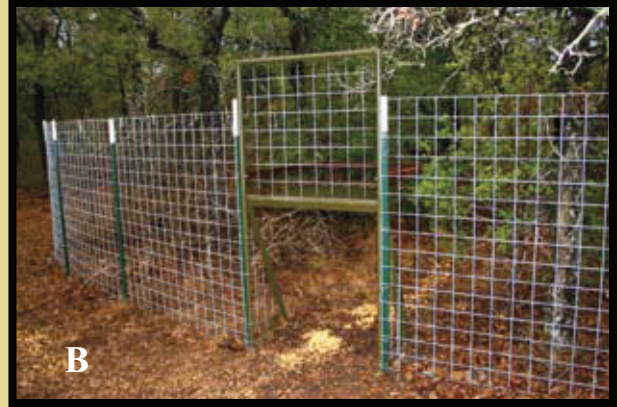
Figure 8. Saloon-type doors require springs for closure (A). Lifting doors can be set in an open position, and once triggered, additional hogs can push their way inside the trap. This model is a lifting gate modified to act as a drop gate on initial capture. After triggering, the gate will close but permit additional hogs to enter (B).

For large corral traps, the trigger should be placed at the back of the trap, away from the door. This allows many hogs to enter the trap prior to door closure. Most trap triggers are made with wire. Some individuals use picture framing wire, as it is durable enough to spring the trap but will break if a hog becomes entangled. The wire is attached to a two-by-four or other prop mechanism on the trap door and is run to the back of the trap, where bait is placed in a hole or scattered on the ground (Fig. 9). T-posts or trees, are used to support the wire from the trap door to the back of the trap. Construct wire eyelets and attach them to the T-posts or trees. As hogs root for the for bait, the wire is stretched and the prop is pulled out, triggering door closure.