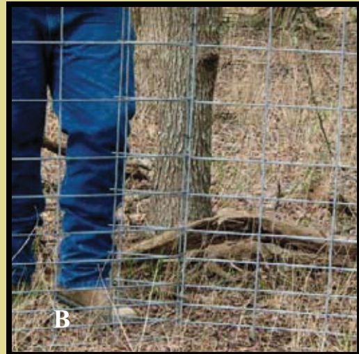
Figure 5. Panel secured to a head gate T-post with doubled wire (A). Remaining panels are attached to one another. It is very important to overlap the ends of the panels (B).

For most corral traps, it is easier to attach all of the panels to one another prior to driving the T-posts. Once all panels are in place and secured, the trap can be shaped by pulling the panels to their desired location (Fig. 6). If the trap is in a wooded area, trees are often used for support.