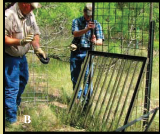
Figure 4. Use steel T-posts to secure a head gate (A). Make sure the head gate fits snugly against the T-posts using a doubled strand of baling wire (B).

Once the head gate is in place, use the panels to form the desired shape of the trap. Trap size, shape, and number of T-posts are dependent upon the number of panels used and whether the trap location is in the open or a wooded area. Secure panels to the head gate T-posts with doubled wire (Fig. 5A). Next, secure the remaining panels to one another. Be sure to overlap the panels at least 6-8" when tying them together. For most panels, this overlap will be one or two mesh squares (Fig. 5B). Attach the panels as securely as possible using doubled baling wire and/or hog rings. Hog rings and pliers can be purchased at your local hardware store.