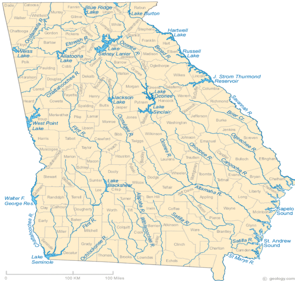
Figure 1. Georgia's Waterways: Along with its coastal waters, Georgia is home to 12,000 miles of streams and over 500,000 acres of reservoirs.

the Blue Ridge and Piedmont ecoregions while hydrilla, Japanese climbing ferns and the Asian clam threaten habitats and species in the Southeastern Plains. Finally, the Southern Coastal Plain is facing significant negative impacts caused by flathead catfish, water hyacinth, alligatorweed, parrotfeather, giant reed, and the channeled apple snail (GADNR 2005).