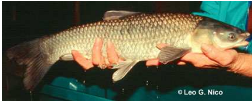
Leo Nico, USGS

The black carp is a bottom-dwelling molluscivore that has been used by U.S. fish farmers as a biological control for disease-carrying snails in their farm ponds. Black carp was first brought into the U.S. from Asia in the early 1970s as a "contaminant" in imported grass carp stocks. Subsequent introductions of black carp occurred in the early 1980s. During this period it was imported as a food fish and as a biological control agent to combat the spread of yellow grub ( Clinostomum marginatum ) in aquaculture ponds. The first known record of an introduction of black carp into open waters occurred in Missouri in 1994. The black carp has since been reported in Arkansas, Illinois, Mississippi, and Missouri (ISSG 2008). Black carp are considered to be a future threat to Georgia although there are no known populations present in the state. Current laws in Georgia prohibit the possession and importation of the species into the state. However, they have been documented in other southeastern states and have been shown to have significant ecological, economic, or health impacts where they occur.