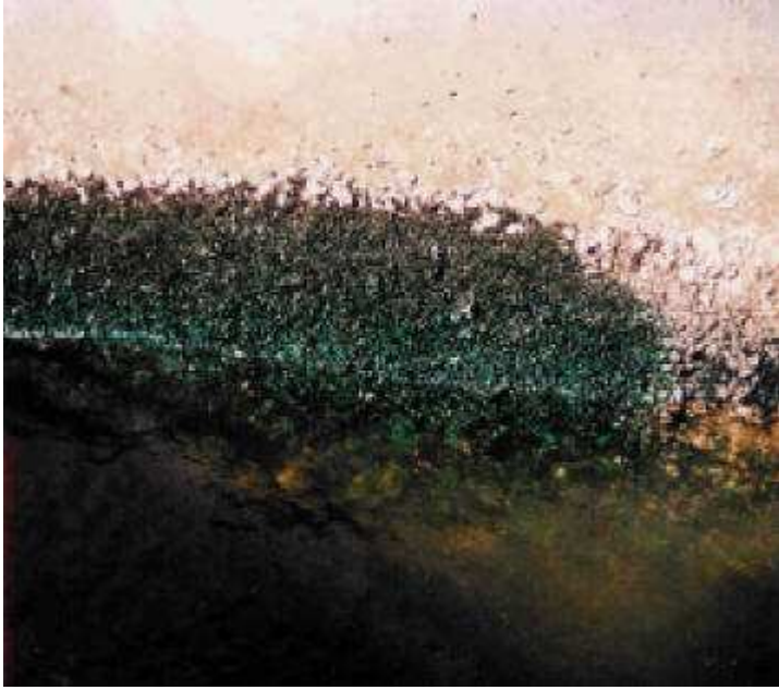
U.S. Geological Survey

Green mussels are bivalve mussels native to the Asia-Pacific region where they are widely distributed. Green mussels generally inhabit intertidal, subtidal and estuarine environments with high salinity. They attach to hard substances, but are capable of relocating. Dense colonies can develop in optimal temperature and salinity conditions, sometimes with thousands of individuals per square meter. The introduction of green mussels into Australia, Japan, the Caribbean, North America, and South America was caused by fouling on boat hulls or ballast-water discharge. Because of its dispersed spawning nature, lack of local predators, fast growth, and high tolerance of environmental conditions, the green mussel population is expected to expand in Atlantic habitats until it reaches its ecologic limits (ISSG 2008). The green mussel was first introduced to the U.S. in Tampa Bay in 1999, where it resulted in significant ecological and environmental damage (Power et al. 2008). There are concerns that the species will establish populations at Gray's Reef National Marine Sanctuary, located off the Georgia coast (Power et al. 2004).