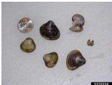
Shawn Liston, Audubon of Florida, Bugwood.org

Asian clams have a yellowish to black shell with concentric, evenly spaced ridges on the shell surface. They are found in lakes and streams of all sizes, and prefer fine, clean sand, clay, and coarse sand substrates. Asian clams are usually found in moving water because they require high levels of dissolved oxygen and are generally intolerant of pollution. These clams are native to southeastern China, Korea, southeastern Russia,