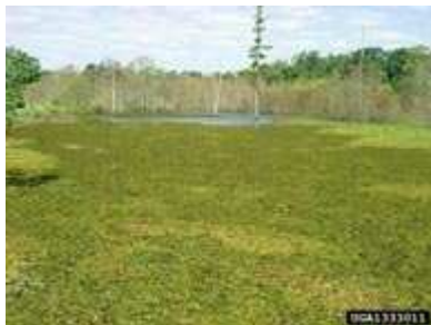
Kenneth Calcote, Mississippi Department of Agriculture and Commerce, Bugwood.org

Giant salvinia is a floating aquatic fern that thrives in slow-moving nutrient-rich warm freshwater including ditches, ponds, lakes, slow rivers and canals. Because growth is greatly stimulated by an increase in nutrient levels, the weed is particularly fast-growing in areas where the hydrological regime has been altered by humans, encouraging an increase in nutrient levels (for example by increased runoff or fertilizer leaching). Giant salvinia is a native of Southeastern Brazil and northern Argentina. Since the 1940s, this plant has been dispersed by humans to various tropical and subtropical regions in Africa, Asia, the Australasia-Pacific region and, more recently, the U.S. (USSG 2008). It has been present in Georgia since 1999 (Benson et al. 2001). The introduction of giant salvinia has been linked to the cultivation activities of botanical gardens and commercial horticulture sites. Giant salvinia may be spread over long distances (within or between water bodies) on anything entering infested waters, including boats, trailers,