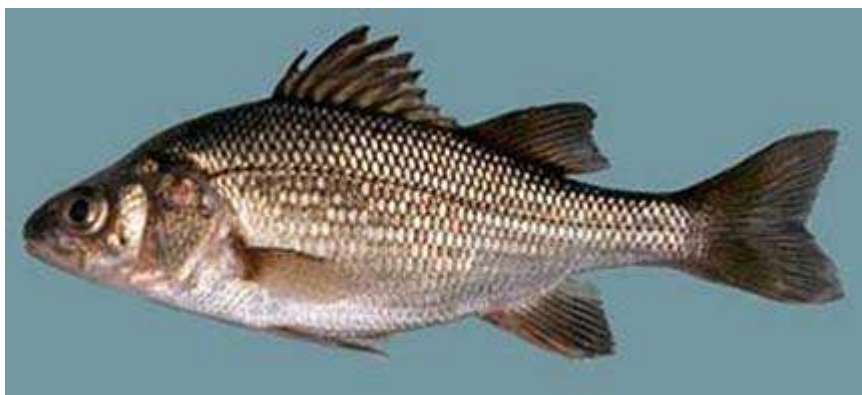
Douglas Facey, USGS

White perch is a semi-anadromous fish that in its native range migrates from the saltier areas of bays and coastland into tidal-fresh portions of streams and rivers to spawn in