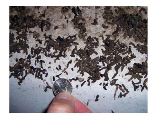
Little Brown Bat Guano Compared to a Nickel

Evening bats are more commonly found in buildings than in bat boxes. The bats are found statewide. This bat is just over 2 inches in length. They have glossy brown fur, rounded ears and a swollen muzzle and look very similar to a big brown bat, only smaller.