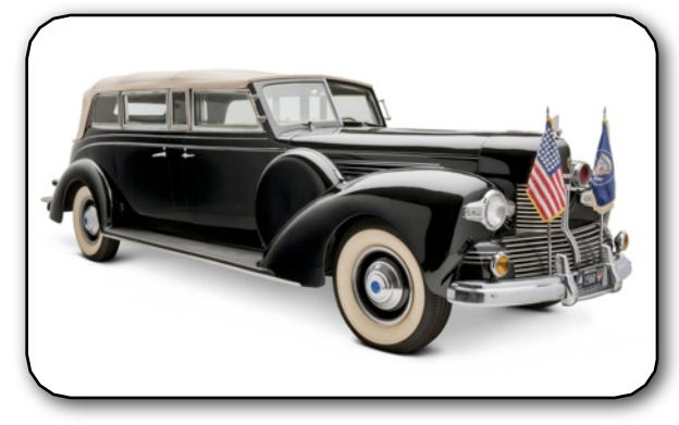
The Sunshine Special

Washing the Queen Mary on Greenville St.