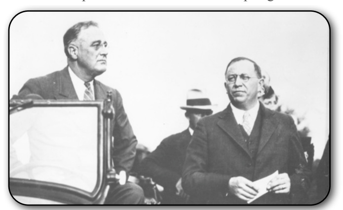
Dedicating the new Flag Pool in Warm Springs