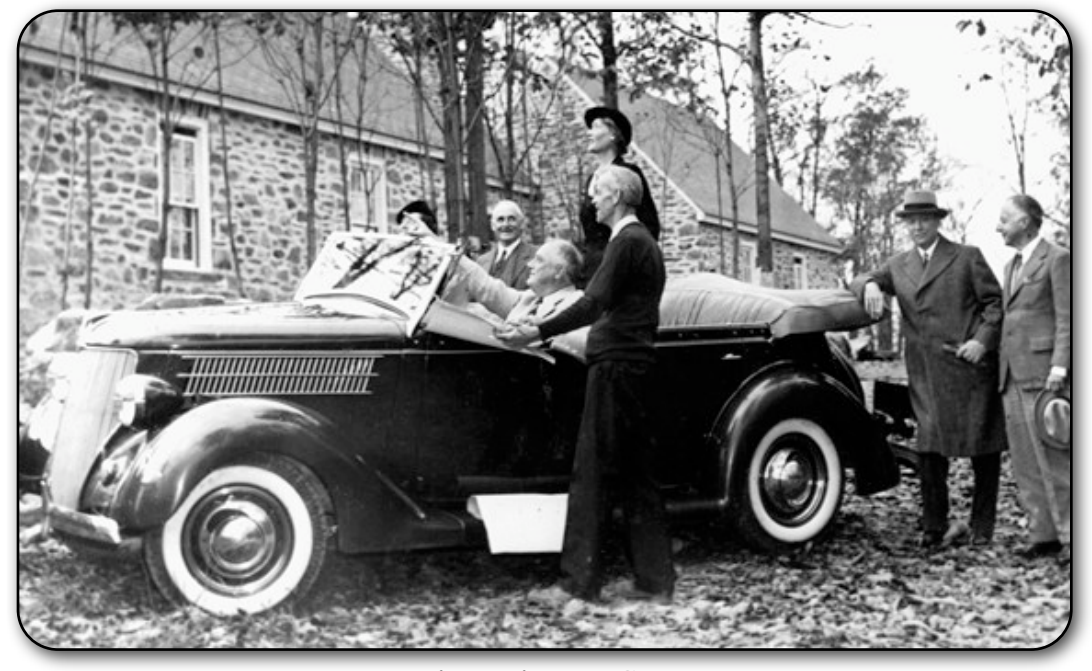
FDR inspecting Top Cottage