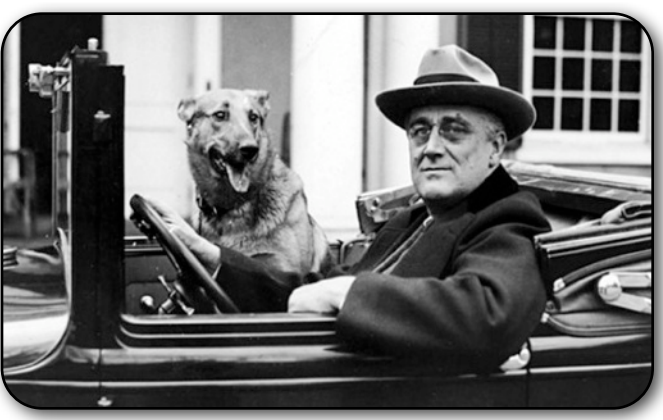
A man, his dog, and his DeSoto!