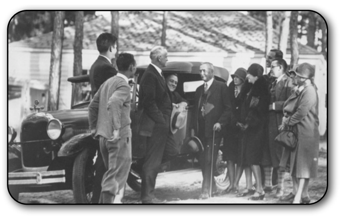
A meeting of friends in Warm Springs