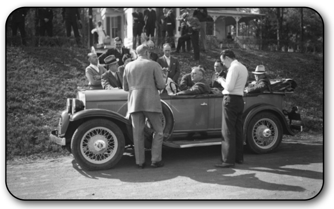
Roadside press conference in Warm Springs