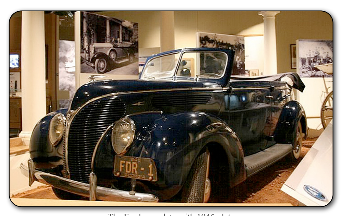
The Ford complete with 1945 plates