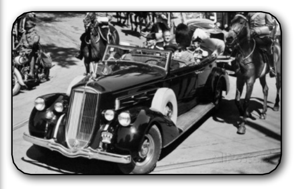
1936 Pierce Arrow