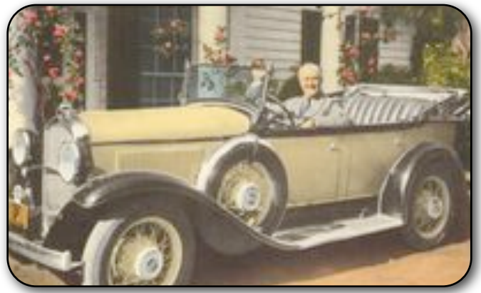
Colorized postcard in front of the Little White House

In 1932 Governor Roosevelt purchased a sporty 1932 four-door convertible Plymouth PA Phaeton. He would log hundreds of miles in this car, hold dozens of press conferences and visit the countryside of Georgia. The press eagerly waited for him to get behind the wheel and follow the Governor and later President to wherever he wanted to go.