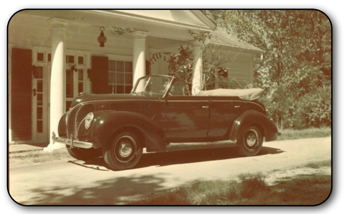
Ready to hit the road