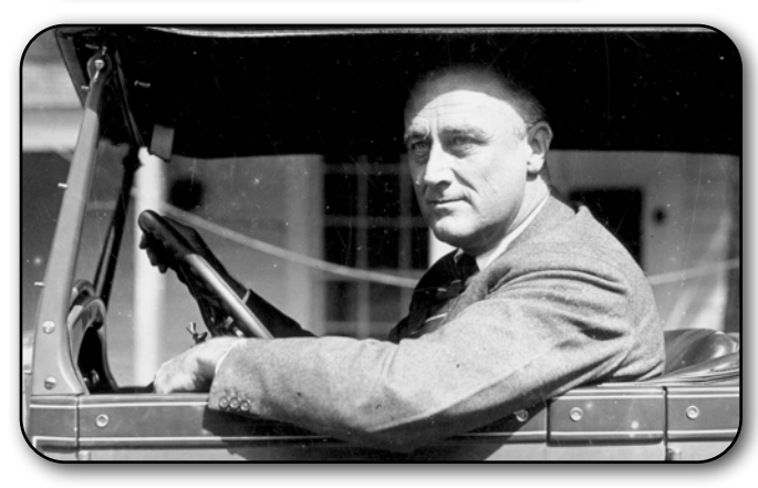
Governor Roosevelt in front of his cottage