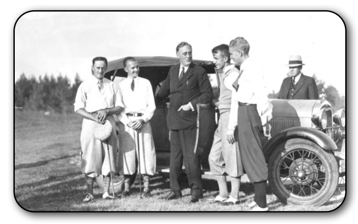
Dedication of the new 9 hole golf course