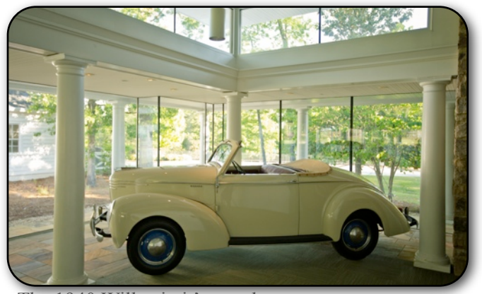
The 1940 Willys in it's new home