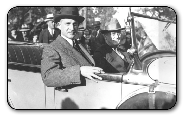
Riding with government officials