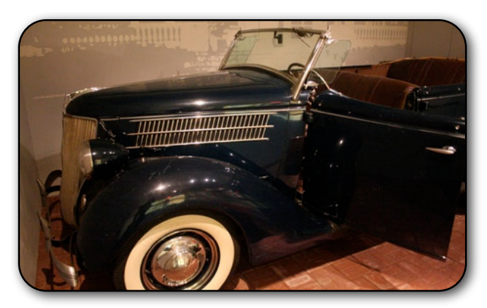
1936 Ford Phaeton Convertible