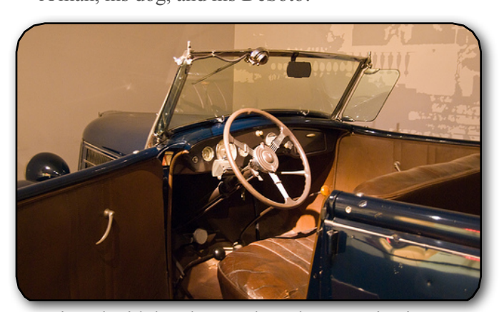
Equipped with hand controls and automatic cigarette dispenser