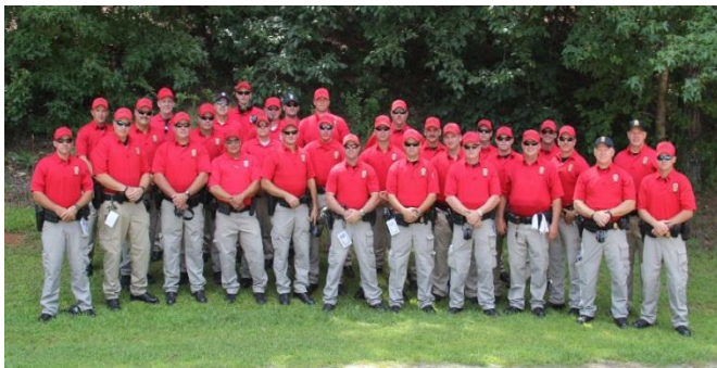
Firearms Instructors at Spring Training