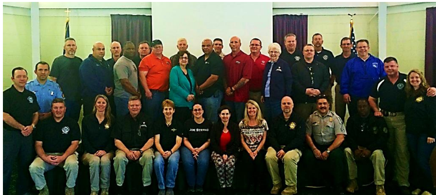
Post Critical Incident seminar attendees

Two Rangers continue to participate in the Crisis Intervention or Critical Incident training and are part of the Peer Support Team. The Peer Support Team (PST) consists of personnel who are specially trained as skilled listeners. The objective of the PST is to provide support for law enforcement personnel, and their immediate family, who have experienced a critical incident or traumatic event. A Critical Incident is defined as any incident, action, or event, which has the potential for producing significant emotional trauma that may adversely affect the psychological well-being of law enforcement personnel.