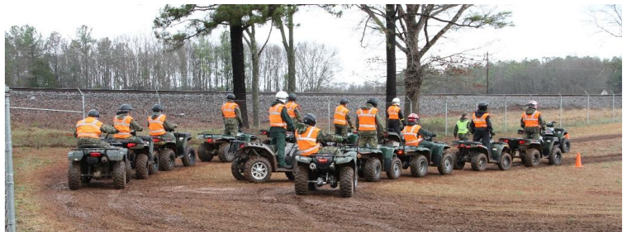
Advanced ATV Operations Training

Rangers were kept busy attending training throughout the year, all participated in an advanced ATV Operations course held at the public safety training center in Forsyth. Many returned bruised and battered, but the training was appreciated by all. Each Ranger also attended ALERRT training to prepare them for a rapid response to shooting scenarios.