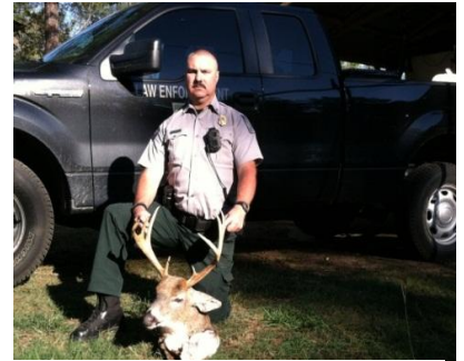
RFC Mills with a poached buck

On October 11 th , RFC Allen Mills received a complaint through the Ranger Hotline in reference to hunting deer at night. The anonymous complainant stated that an individual had taken a large deer at night with a rifle and was passing it off as a legal bow kill. The complainant gave RFC Mills a name, the county the deer was taken in and a social media site that had a picture of the subject with the deer. After conducting several interviews on four subjects over several days, RFC Mills was able to gain confessions from both subjects involved, one of which was a convicted felon. The deer antlers and cape were confiscated and donated to a local wildlife club, and the meat was taken to a nearby deer processor and donated to a needy family. The convicted felon's probation officer was notified about the case.