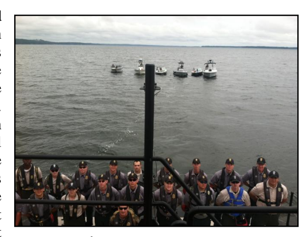
30<sup>th</sup> Ranger School Cadets on the General Irwin with patrol vessels and instructors in the background

In June the 30<sup>th</sup> Ranger School visited George Bagby State Park, located in Region V for a week of boat operations training. During the week of training the Cadets received a block of High Value Asset/Port Security Training. The U. S. Army Corps of Engineers assisted with the training by providing the General Irwin, a 160 ft. tug boat, to serve as the on-water high value asset. The Cadets learned techniques of patrolling marine security zones and high value asset protection along with normal boat operations and patrol techniques.