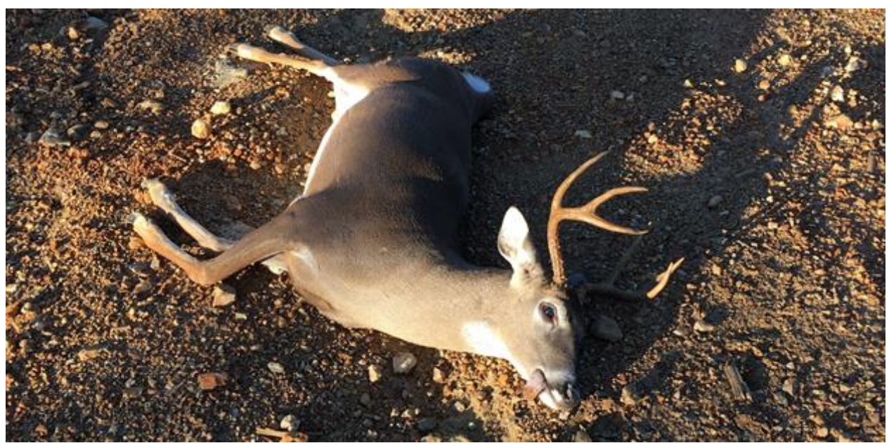
Confiscated 7 point killed without permission in Gordon County

On November 21<sup>st</sup>, Game Warden Corporal Shawn Elmore received a call from a hunter off of Trimble Hollow Rd about someone hunting without permission. Cpl. Elmore responded to the area and located the complainant and a hunter. The hunter admitted to hunting without permission and killing a 7 point buck. The hunter was issued a citation for hunting without permission and his 7 point buck was confiscated and given to the complainant.