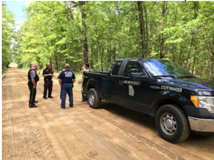
Officers preparing to search wooded area.

Later that day, Game Warden Mills was contacted to assist the Dodge County Sheriff's Office with searching for evidence in a double homicide case. Evidence pertaining to the case was located.