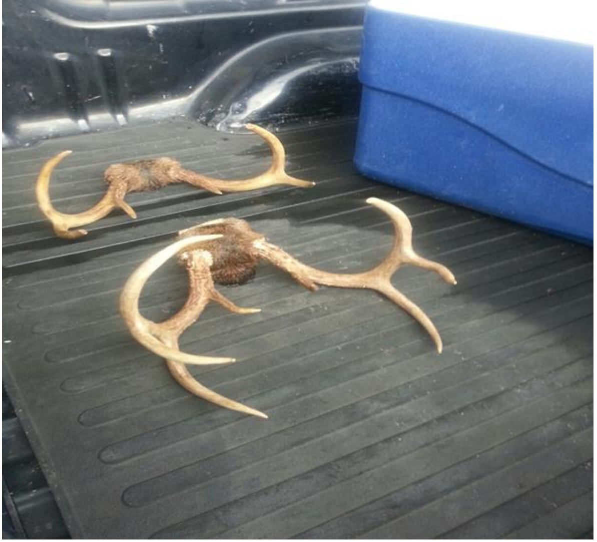
September 11 Atkinson County Buck on Top September 12 Coffee County Buck on Bottom

On September 12<sup>th</sup>, Corporal Tim Hutto completed a complaint based investigation on a subject who killed an eight point buck at night on September 10<sup>th</sup>. After interviewing witnesses and gathering evidence one subject was charged with hunting deer at night. One eight point buck and a cooler of deer meat was confiscated.