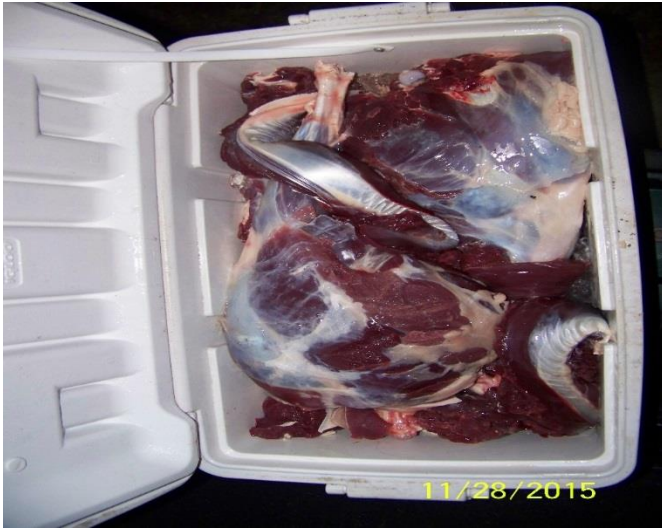
Deer meat seized from poachers in Bacon County.

On November 27 th , while patrolling local dog-deer hunting clubs Corporal Mark Pool checked several dog hunters actively pursuing deer. Cpl. Pool checked several licenses and documented a violation for hunting big game from a public road.