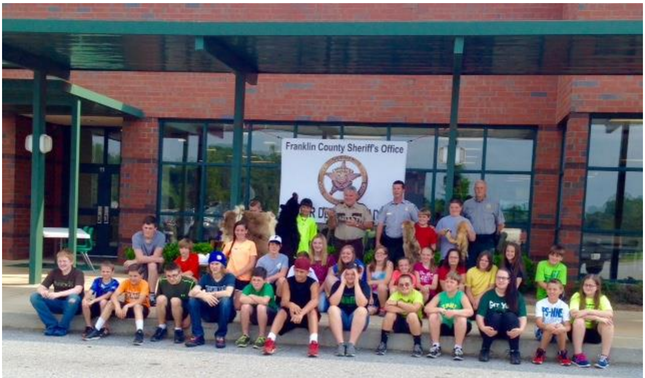
Franklin County Sheriff's Office Junior Deputy Camp