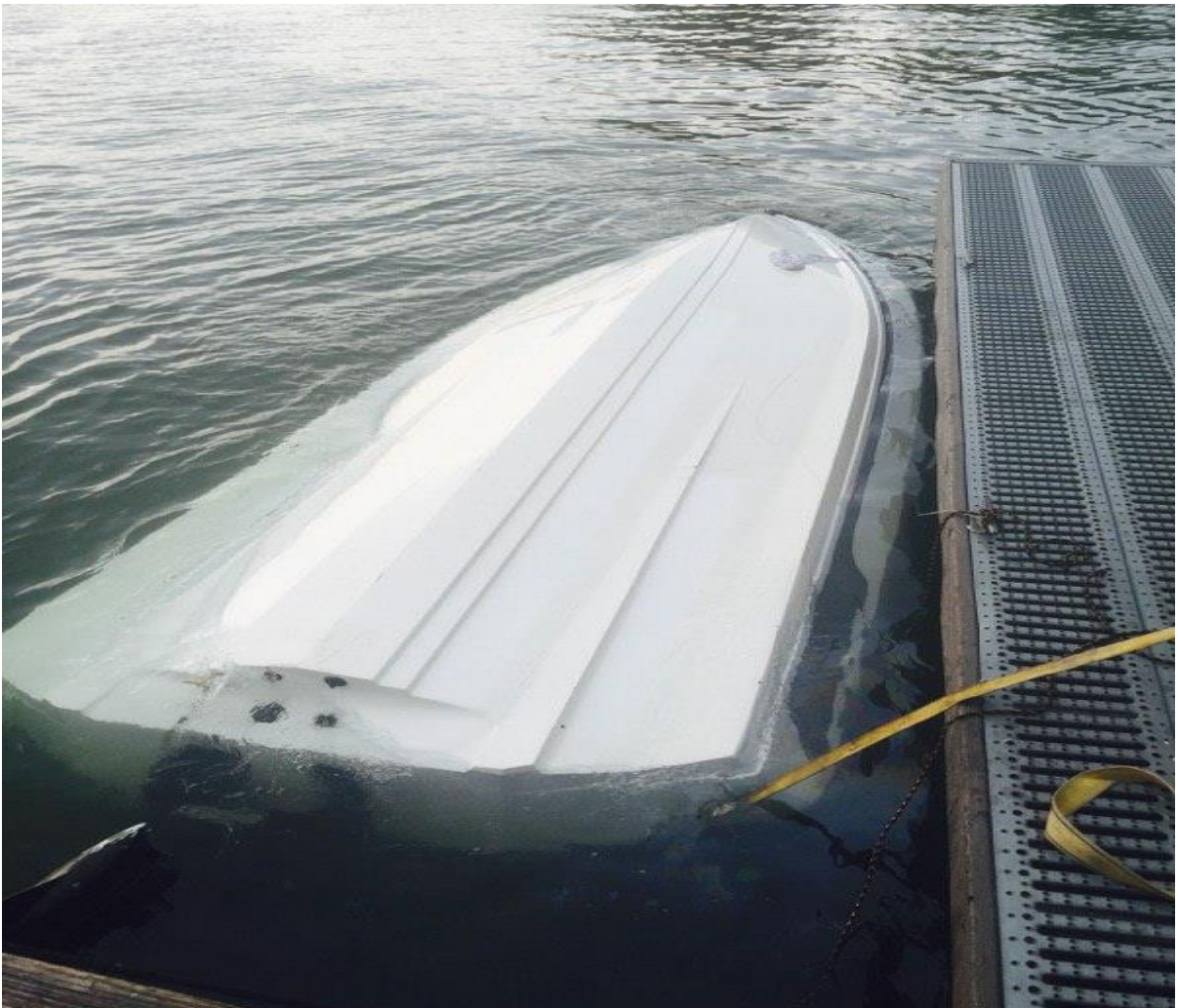
Capsized 19 foot Aries Bass Boat on Allatoona Lake

On June 9 th , Cpl. Byron Young responded to a boat incident call on Allatoona Lake near Victoria Marina. Two males running at an estimated 55 MPH in a 19 foot bass boat were ejected when the operator took his hands off the steering wheel. The bass boat turned hard left and capsized, ejecting the two men into the water. Neither man was wearing a PFD (lifejacket) but were able to swim to the boat and hold on until a boater in the area came to assist. The two men were stunned that they are still alive.