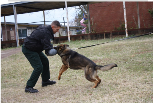
K-9 Handler Training