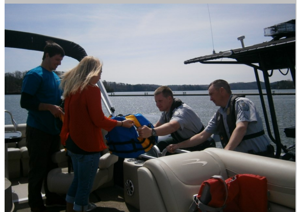
Conservation Rangers performing a boating safety inspection.