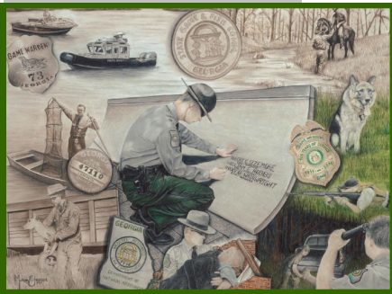
100 Years of Conservation Law Enforcement as depicted by Montana Etheridge

Strategy 1.9 Research the prospect of a statutory requirement for DNR LED to be the report repository of drownings that occur on or in waters of the state.