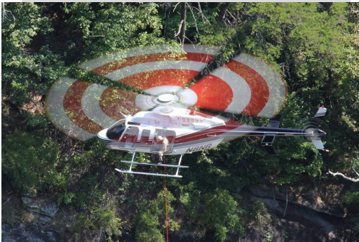
Long Line Rescue Training At Tallulah Gorge

Strategy 3. 6 Continue succession training to develop and prepare the future leaders of the Law Enforcement Division.