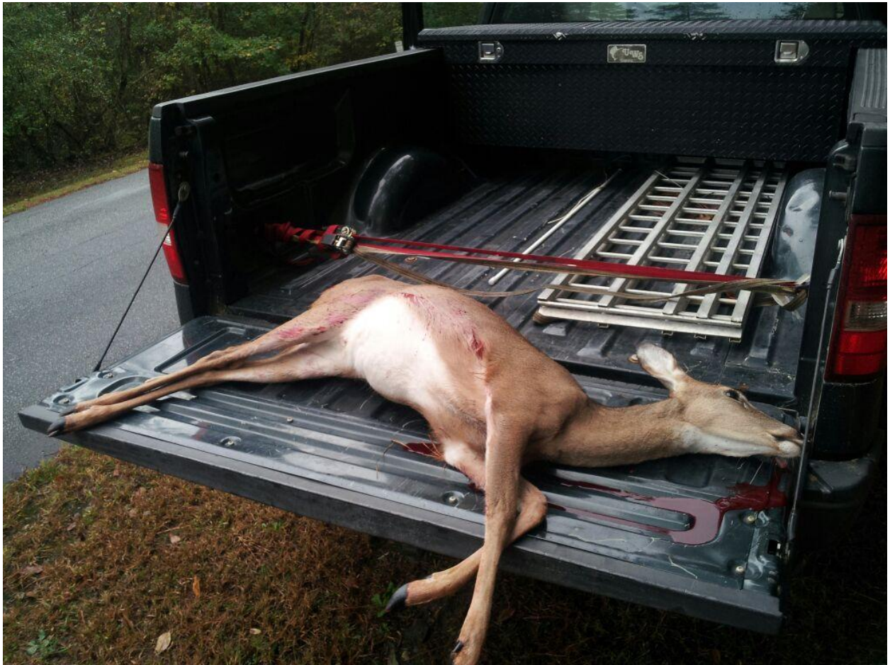
Doe found on roadway where a witness saw a person shoot from a truck.