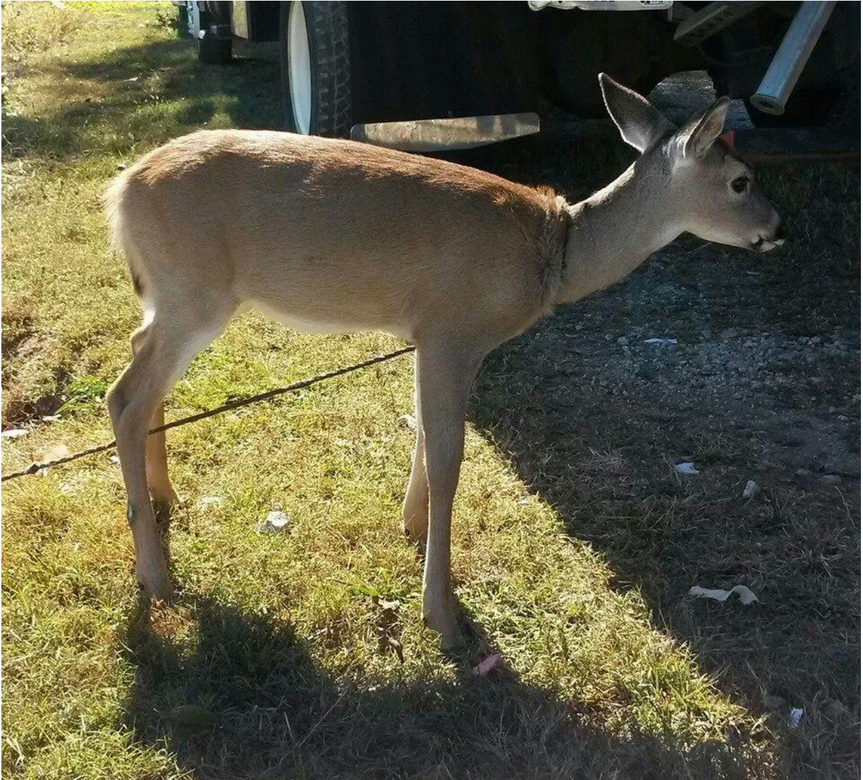
Doe fawn deer found tied up with rope in Mableton.