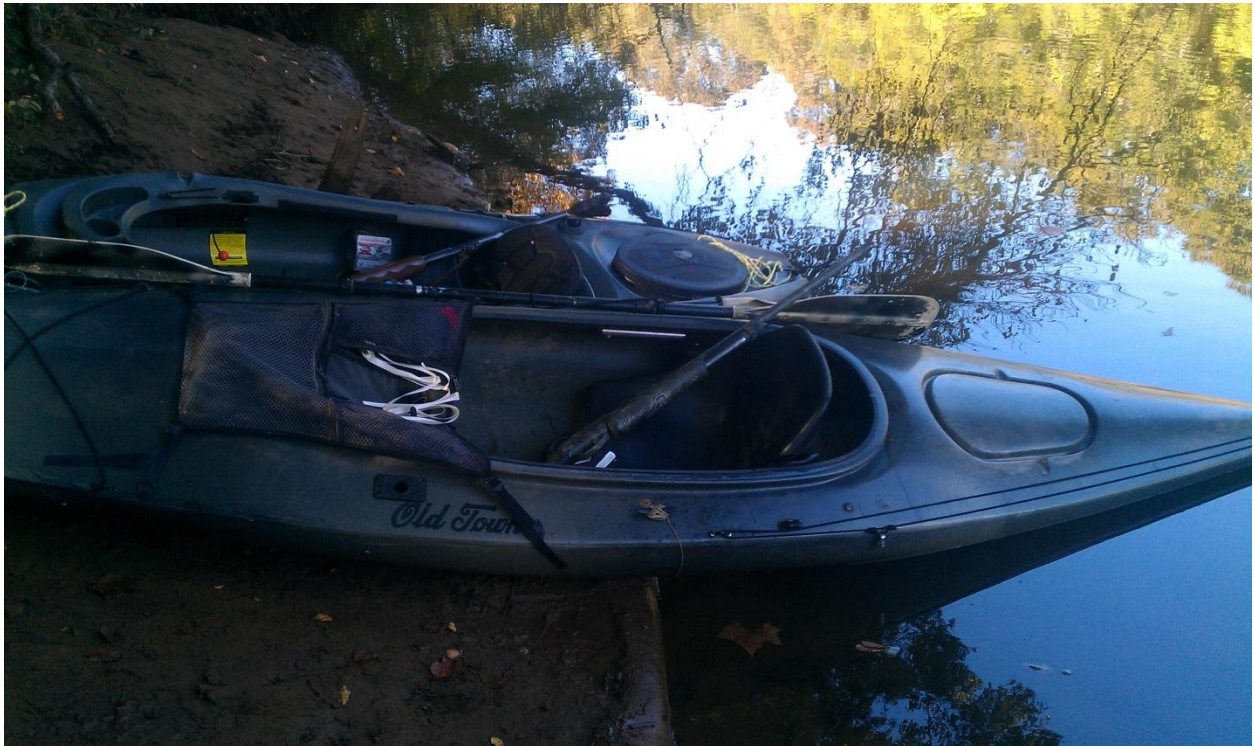
Kayaks used by goose hunters on Etowah River.

On October 20th, Cpl. Byron Young and RFC Brooks Varnell were patrolling the area of Hardin Bridge Road and the Etowah River. The Rangers located two young hunters who were goose hunting out of kayaks on the Etowah River. The two young hunters were found to be hunting without a federal duck stamp and unplugged shotguns. The young hunters were issued warnings for the violations. The Etowah River is a cold water environment and any winter boaters should be prepared, use life jackets, let family or friends know the float plan, and have a plan to deal with an overturned boat or bad weather.