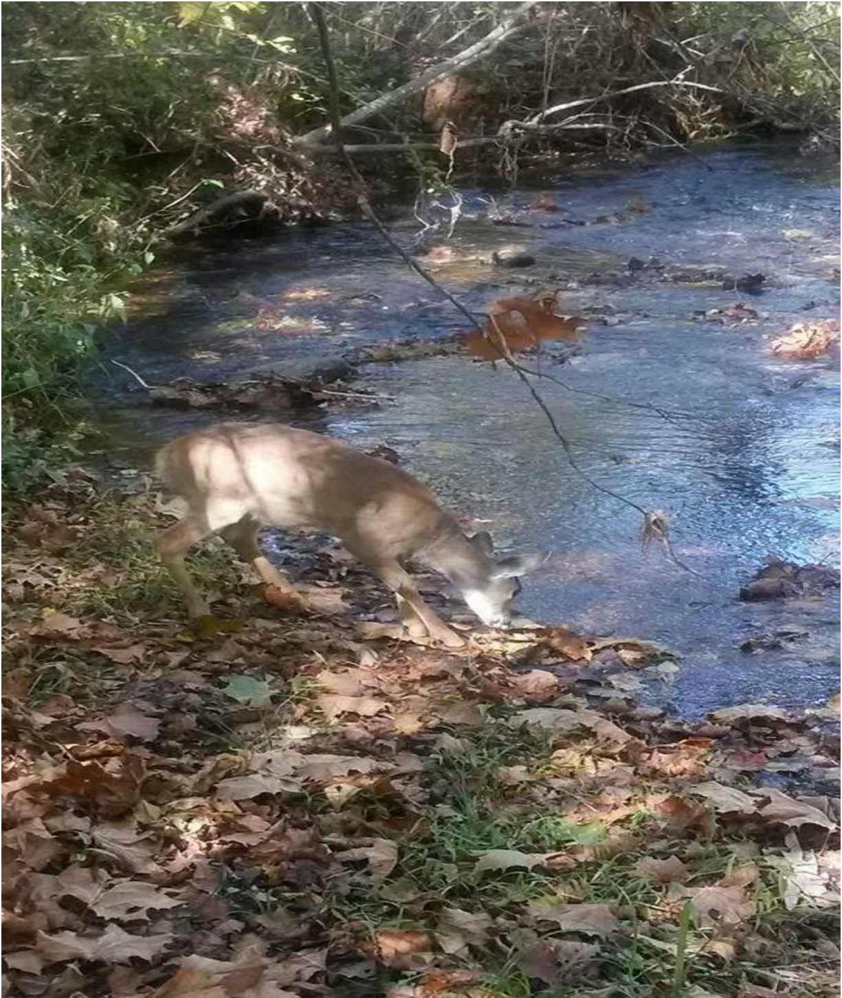
Doe fawn released back into the wild.