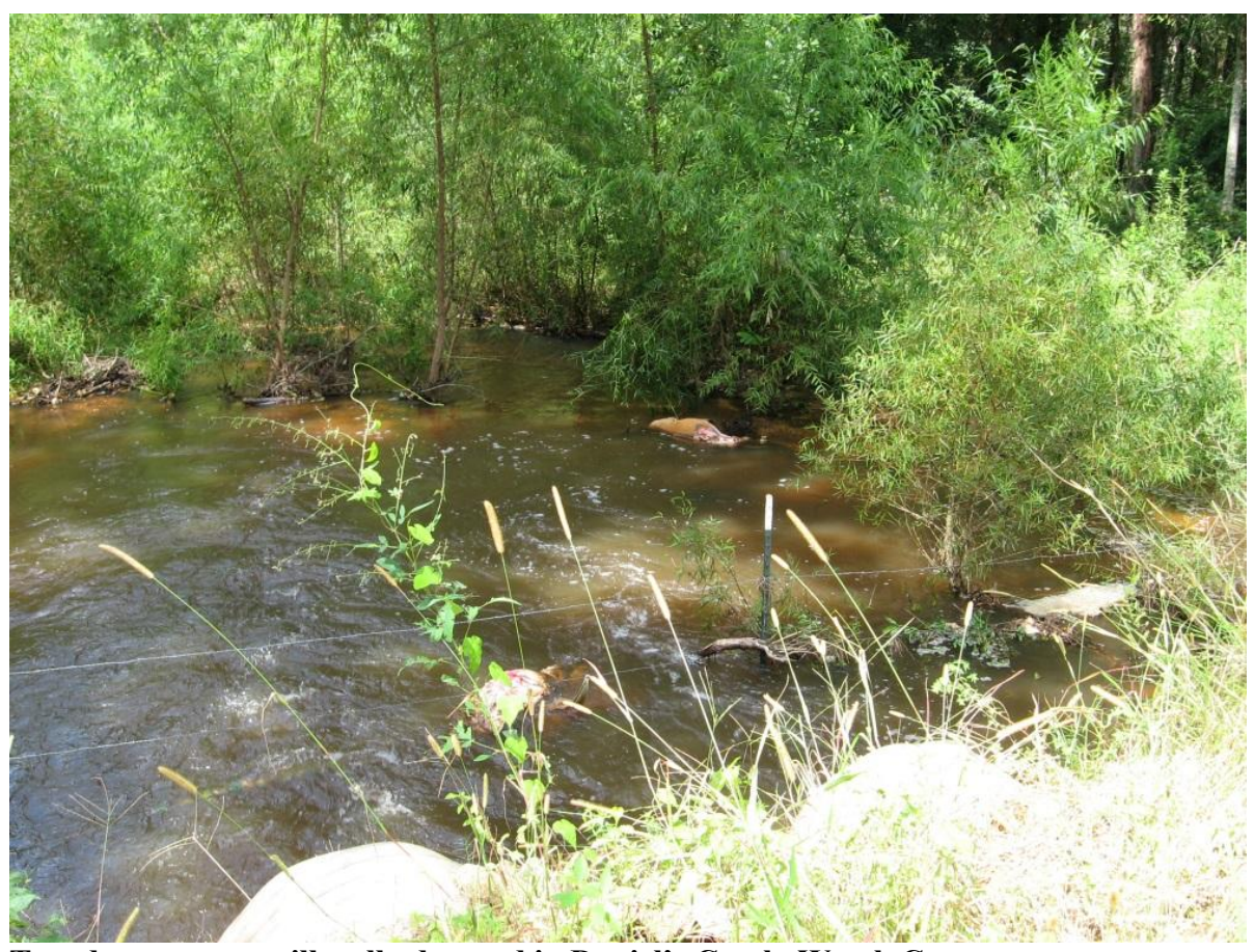
Two deer carcasses illegally dumped in Daniel's Creek, Worth County