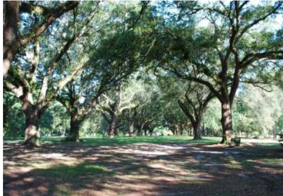
31 acre Tift Park continues to serve as a public park.

Tift park was created by the city’s beautification project of 1912 and designed by Atlanta landscape architect, Otto Katzenstein. The park was named after segregationist Nelson Tift, founder of the city of Albany and owner of the Bridge House also listed on the National Register. 1 The park included a zoo from the 1930s to 1977 and in the 1950s a swimming pool was added.