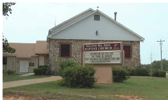
Second Mount Zion Baptist Church.

Whites reacted to this progress with hostility and violence toward blacks in Albany and throughout the region. The Camilla Massacre of 1868 in nearby Mitchell County offers proof that whites in the region were not accepting of blacks attaining equal rights. On September 19, 1868, a few hundred black and white Republicans marched to Camilla for a political rally. Hostile whites attacked the marchers as they entered the courthouse square; 30 marchers were shot and twelve died. 6