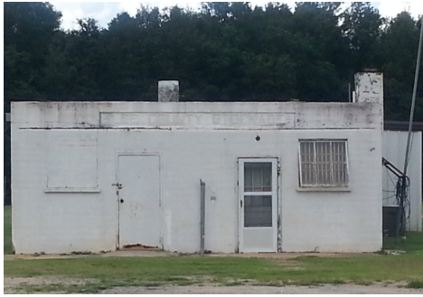
The Leesburg Stockade still stands off Leslie Highway.

It has been readily acknowledged by noted civil rights activists and scholars that the Americus Movement was one of the most significant social movements of its era.