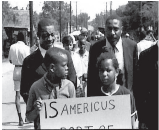
Activist-Comedian Dick Gregory (2nd row, right) marches with Americus youth, 1963.

Georgia African American Historic Preservation Network