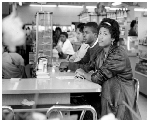
Student protesters at McCrory's in Savannah in 1961