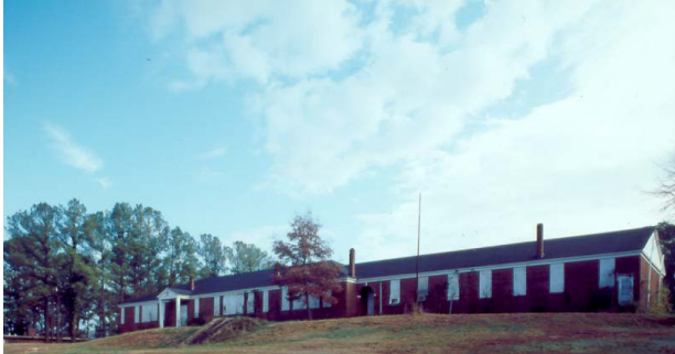
Classrooms and the auditorium were added to the north end of the building to relieve overcrowding.

land and built a new high school while Floyd County began paying teachers' salaries shortly after the Brown v. Board of Education Supreme Court decision. This strategy resulted in the construction of six buildings on the Main campus between 1955-1963 that