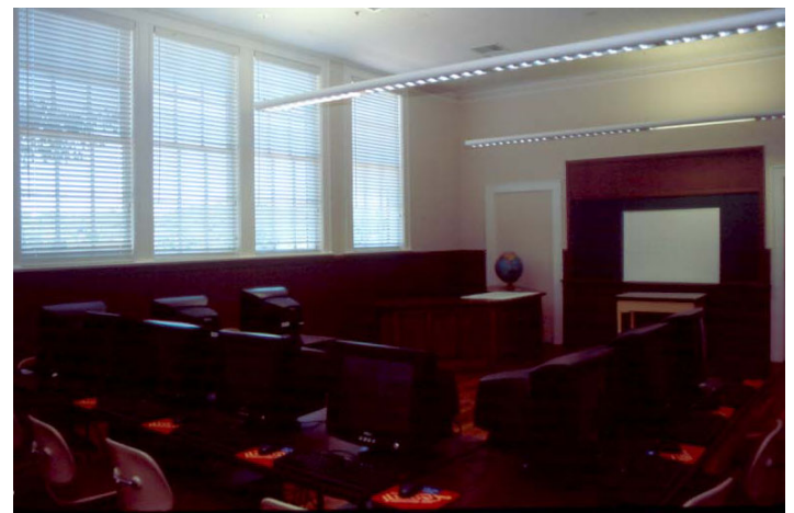
After the renovation, this classroom is used for a technology center equipped with modern computers.