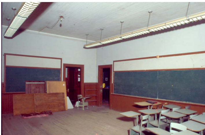
Prior to the renovation, this classroom had original blackboards and beaded wainscoting that were intact.

The African-American Historical Society began to seek preservation assistance with the Rome Historic Preservation Review Board to list the building in the National Register of Historic Places. The partners sponsored a nomination to the Historic Preservation Division and the Main High School building along with six other historic