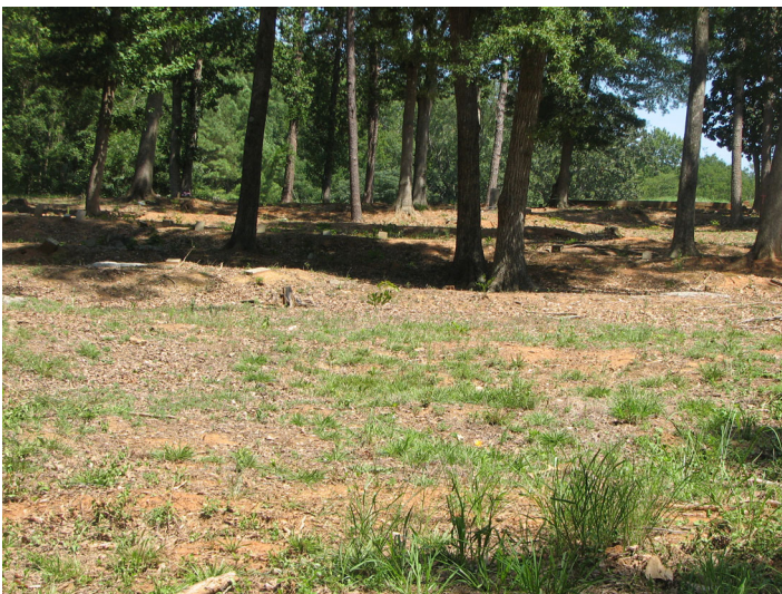
The School Street Cemetery landscape encompasses trees and slopes with graves interspersed throughout the terrain.

Drive down School Street in Washington, Georgia and the seen and un-seen vestiges of the past, present, and future will enthrall you. This thriving working class community holds tremendous history that bears witness to change – socioeconomic, environmental, and ecological.