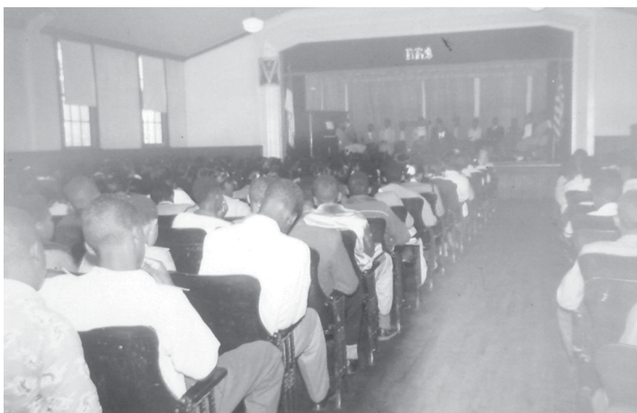
Students attended the weekly assembly in the Main High School auditorium. This addition to the school was constructed in 1938.

Hermina Glass-Avery, continued from page 3