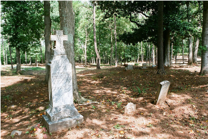
Headstones of all varieties in School Street Cemetery celebrate the African Americans who lived and worked in Washington and Wilkes County.

Cemeteries convey important social and cultural information about the interred and their communities by articulating a group's folkways, traditions, customs and beliefs. More than just a graveyard, they are cultural landscape museums encompassing material symbols that link the past to the present. Through landscape layout, vegetation, orientation of graves, grave offerings and plantings, marker types and inscriptions, these open spaces manifest to the living the longings, aspirations, and hopes of our ancestors.