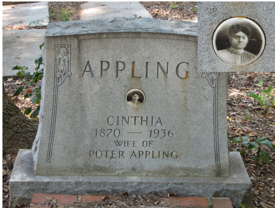
Cinthia Appling's family included her photo in the headstone that adorns her grave.

the east by a dirt road entrance, the landscape is covered with vine-choked oak, pine and pecan trees that cast a canopy over the barren grounds and the deep crevices created by years of erosion, decay and neglect.