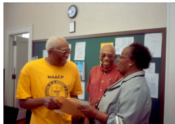
Visitors to the NAACP classroom receive community information.

Today, the new use for the old Main High School includes the Starlight Masonic Lodge #433, which continues to meet in the new community center. Six additional community-based, nonprofit organizations agreed to locate in the building and provide education and mentoring services to youth. They were: 100 Black Men of Rome, the African-American Historical Society of Rome, the Martin Luther King, Jr. Commission of Rome and Floyd County, the NAACP, the Rome Alumnae Chapter of Delta Sigma Theta Sorority, Inc., and the Rome Colored/Main High School Reunion Committee. Each organization occupies the former classrooms of Main High School. Three common areas, including a portion of the former auditorium, provide ample space for larger community functions and mentoring programs.