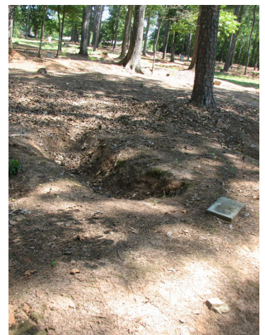
Sections of the School Street Cemetery contain deep depressions.