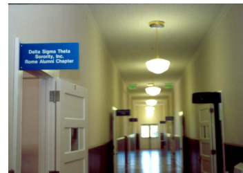
Signs above the classrooms delineate the fraternal and service organizations' meeting spaces.