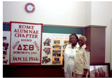
The Rome Alumnae Chapter of Delta Sigma Theta Sorority, Inc. are one of the community center's new tenants.

Rome Colored/Main High School alumni hold biennial reunions to foster additional community support for the preservation project. Alumni that still live in Rome and Floyd County and were active members of nonprofit organizations provided community services and mentoring programs to students, although they had no dedicated meeting place. These organizations stimulated a new use for the old building.