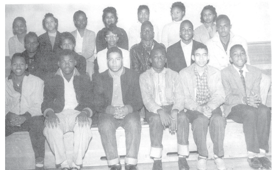
This Rome Colored/Main High School class photo was included in the 2001 reunion booklet.

The school was originally organized in 1883 under the auspice of the North Georgia General Missionary (Negro) Baptist Association as Rome High and Industrial School until it was absorbed into the city school system in 1894. The Board of Trustees of Rome City Schools agreed to donate land and to build a "main"