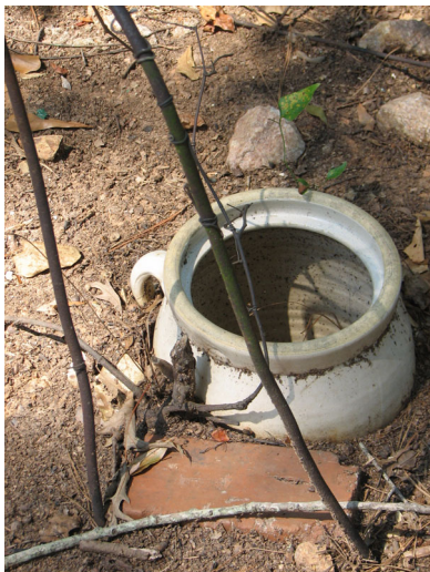
Pottery adorns this grave.

However, a stroll through School Street Cemetery reveals a variety of important artifacts that assist in understanding African and Afro-European traditions that have survived for centuries: kinship networks, death and burial practices, material and non-material culture including pottery, ceramics, crafts, superstitions and folk medicine. A few of the marked gravesites contain bits of biographical information that could prove useful for genealogical and family history purposes.