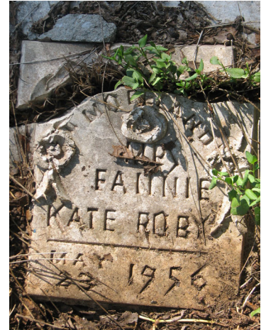
Some headstones are broken in the School Street Cemetery.

Bound on the north, west and south by thick trees and overgrown brush and on