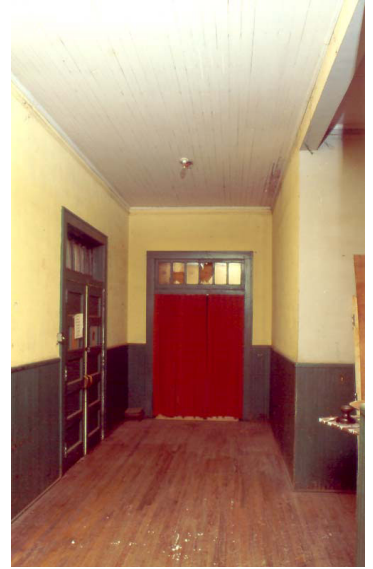
The classrooms with wood doors and transoms were saved in the preservation of the Main High School building.

Main High School eventually closed in 1969. While the other buildings on the campus continued educational functions, the old high school became a storage facility for the school system and the meeting place for the Starlight Masonic Lodge #433. In 1995, the African-American Historical Society of Rome began a dialogue with the City Manager to preserve the Main High School building, thus saving it from the wrecking ball. The City Commission installed a new roof to prevent further damage to this historic building.