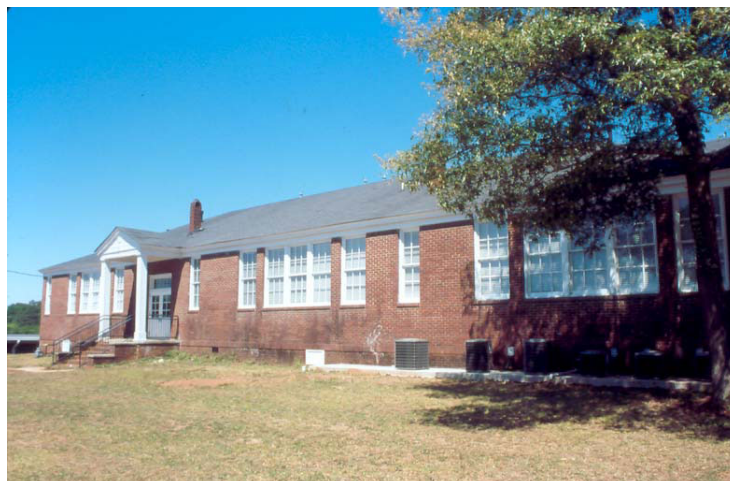
The west elevation of Main High School faced the other buildings on the campus. Main High School was listed in the National Register of Historic Places on October 24, 2002.

1939. Reflecting segregation policies, the new classrooms were furnished with used desks from the city's white high school, and Main High School did not receive electric lighting until 1940, three years after it was installed in the city's white high school.