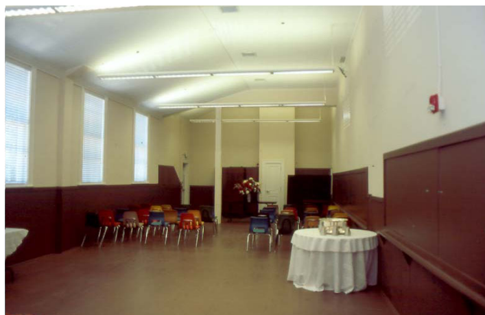
The east wing of the auditorium still provides a large space and a kitchen for community programs today.