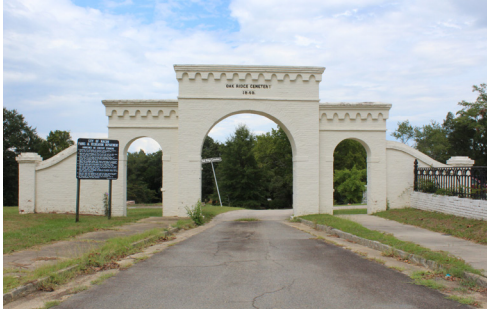
Entrance to Oak Ridge section of Rose Hill Cemetery. Historic Macon Foundation

It is believed there were at least one thousand unmarked enslaved people buried in Oak Ridge.