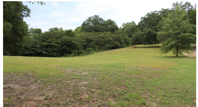
Rose Hill to mark burials of enslaved African in its Oak Ridge section.