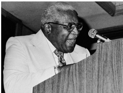
The Rev. Martin Luther King Sr. in Macon, Georgia, July 20, 1977.