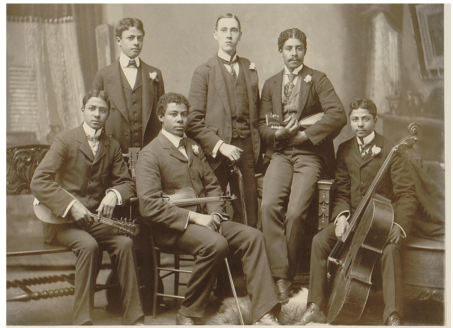
Thomas Askew: "Summit Avenue Ensemble, Atlanta, Georgia" (est. date 1899 or 1900). Silver gelatin print. Library of Congress.

The ability to frame and own one's identity is no small feat; grappling with identity and perception is of historic importance among people of color, many of whom often feel misrepresented and miscast by the news media, commercial advertising and entertainment institutions. In those aforementioned areas, stereotypes are too common, nuances are missed, and representations often lack depth or authenticity. Thus, early Black photographers (and subsequent visual creators) were the early disruptors of the white-controlled visual narrative of Blackness; they were able to present their version of a Black perspective, framed by the authenticity of their experiences, understanding, eye and empathy for their subjects.