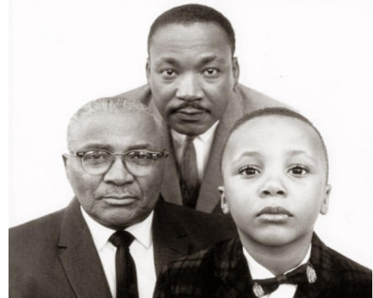
Martin Luther King, King Jr., and King III

King Jr., told a story of his father being stopped by a police officer, and the officer referring to his father as a boy. King Sr., replied, pointing at his son, "This is a boy, I'm a man; until you call me one, I will not listen to you." In 1984, King Sr., died at the age of 84 and was interred next to his wife at South View Cemetery in Atlanta.