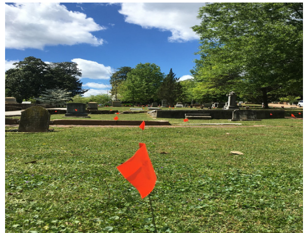
Flags mark results of ground penetrating radar in Oakland's African American section.

The restoration of Oakland Cemetery's African American Grounds is a large project, and one that requires support from the Atlanta community. We encourage you to visit Oakland Cemetery and take one of our tours to learn more about this project. Stop by the Visitor's Center to research if you have ancestors buried at Oakland. If you are a descendent of someone buried in the African American Grounds, we want to hear from you.