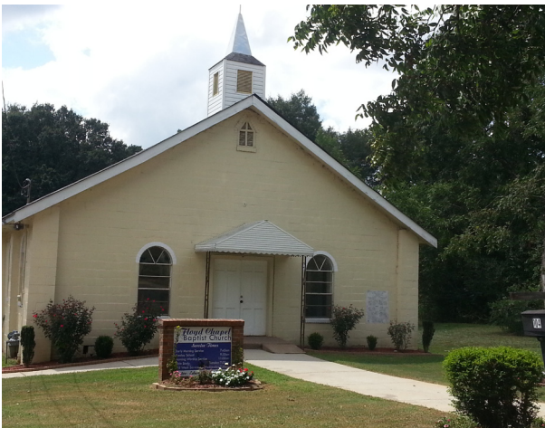
Floyd Chapel Baptist Church of Stockbridge, Founded in 1878.

At the age of 14, King set out to become a licensed preacher at the Floyd Chapel Baptist Church. King was known to have the extraordinary preaching skills from a very young age and more education than many of the deacons in the church which was a bit intimidating to the church's leadership. Soon after receiving his preaching license, King decided to take matters into his own hands and leave Stockbridge. King joined the railroad, and worked as a coal hauler on a steam engine locomotive.