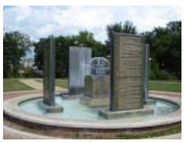
A memorial to the Albany Movement is the centerpiece of the park that is located in Albany's Freedom District.

Mount Zion Baptist Church was listed in the National Register of Historic Places on August 10, 1995. In