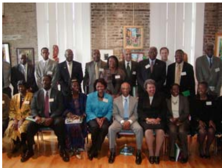
Commissioners gather for a group photo following their induction ceremony. The South Carolina African American Heritage Commission hosted the ceremony at the Avery Research Center for African American History and Culture in Charleston.

The journey to preserve Gullah/Geechee culture began in 2000 when the National Park Service was authorized by Congress to conduct a Special Resource Study . The study focused on a geographical region that included 79 barrier islands and adjacent counties that are 30 miles inland. In Georgia, this area includes seven barrier islands and six counties: Bryan, Chatham, Liberty, McIntosh, Glynn and Camden. The Special Resource Study documented the national significance of the Gullah/Geechee people and their culture. The National Trust for Historic Preservation included the Gullah/Geechee culture on its 2004 annual list of most endangered resources.