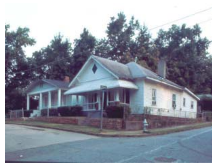
Pictured above is a Georgian cottage (right) and a variation of a bungalow (left).

During the first decade, the increase of industry in Atlanta's southern rail yards required a labor force of skilled, unskilled, as well as domestic laborers. African Americans supplied this labor as they simultaneously created a community that included several black-owned businesses, churches, and schools. The district consists of a wide variety of single-story house types that date from 1883 to 1954 including single shotgun, gabled-ell, side-gabled, hall and parlor, Georgia cottage, to New South, bungalow, and ranch.