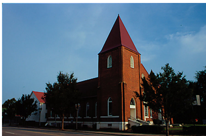
The 1801 St. John wooden building was listed in the National Register of Historic Places on June 17, 1982. The 1897 brick building was listed in the National Register of Historic Places on July 5, 1990.

Springfield Baptist Church continues to preserve both church buildings while the Springfield Village Park Foundation