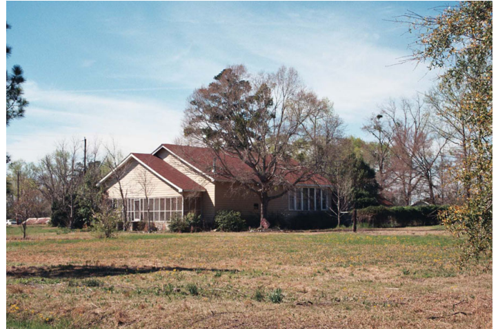
The Omaha Rosenwald School in Stewart County is the first school identified in the inventory that was converted to a residence.

Smithville and the Meriwether County Training School (Manchester) are two surviving brick and wood Rosenwald Schools in Georgia. These school buildings are important because, unlike many others, when they closed as schools they were not demolished by neglect. These school buildings were used for other purposes and their continued existence is important to their local communities.