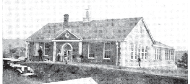
This photo of the Manchester Rosenwald School appeared in the 1928 Georgia Department of Education Annual Report.

The town of Manchester is located in Meriwether County approximately eight miles from Warm Springs, Georgia. In 1928, the Meriwether County Training School appeared in the Georgia Department of Education Annual Report. It was built with the aid of the Julius Rosenwald Fund in order to provide better education for African Americans in Manchester. This five-classroom school was the largest Rosenwald School constructed in the county until 1936, when the Eleanor Roosevelt School was built in Warm Springs and hailed as "The Last Rosenwald School."