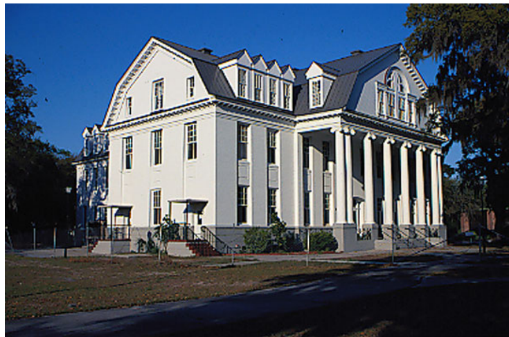
Hill Hall is the oldest building on the campus of Savannah State University. The building was listed in the National Register of Historic Places on April 23, 1981. This photo was taken in 2004, when the exterior restoration was completed.