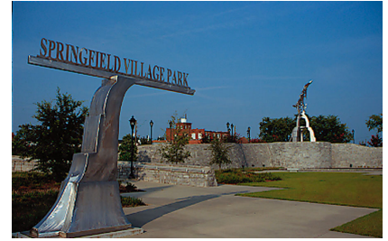
A marquee and the Tower of Aspiration, designed by Richard Hunt, are important elements in Springfield Village Park.