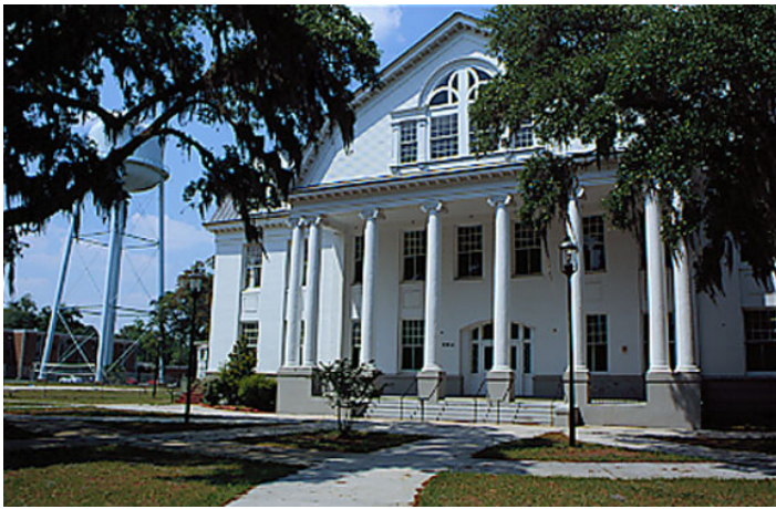
Hill Hall was completed in 1901 by students who were supervised by by trade instructors. The building materials consisted of masonry, wood and metal, and the students received proficiency certificates in the mechanical arts program that was offered at the college.

the remainder was provided through federal funds from the Works Progress Administration and Public Works Administration that was established by President Franklin D. Roosevelt.