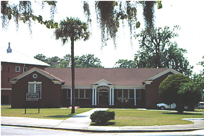
Powell Hall was built on the campus of Savannah State University in 1932 as a three-classroom school for faculty children. The building is presently used for academic offices.