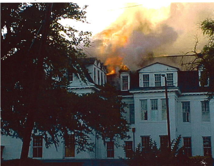
Exterior repairs including a new roof, windows and doors were completed when a fire struck the building in May 2000.

During the early 1990s, Hill Hall began to deteriorate, and Savannah State University implemented a restoration program to preserve the building. In 1992, Hill Hall was selected as one of 11 buildings on HBCU campuses to receive restoration funding from the Black College Initiative of the U.S. Department of the Interior. This program was managed by the National Park Service (NPS) and the United Negro College Fund. In 1996, NPS released the funds, and Savannah State University closed the building and began fundraising initiatives for the match.