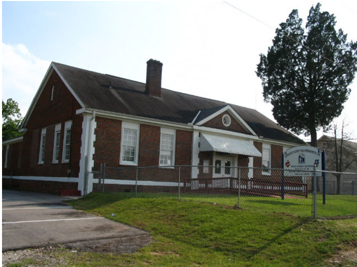
The Manchester Rosenwald School still maintains defining architectural features in 2005. The building is currently used for community services and youth programs.

When viewing Manchester's exterior it is easy to see why Roosevelt was impressed. While its construction follows the standard plan for a five-classroom Rosenwald School, Manchester displays ornamentation not common to wood and brick Rosenwald Schools built during this era. This ornamentation includes a fanlight above its arched entrance, quoins on its front façade corners, a circular window in its front gable and a small cupola on the roof. Though the cupola was removed, other features remain as defining elements of the Manchester school.