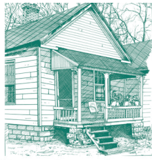
Georgia African American Historic Preservation Network

The Georgia African American Historic Preservation Network (GAAHPN) was established in January 1989. It is composed of representatives from neighborhood organizations and preservation groups. GAAHPN was formed in response to a growing interest in preserving the cultural and ethnic diversity of Georgia's African American heritage. This interest has translated into a number of efforts which emphasize greater recognition of African American culture and contributions to Georgia's history. The GAAHPN Steering Committee meets regularly to plan and implement ways to develop programs that will foster heritage education, neighborhood revitalization, and support community and economic development.