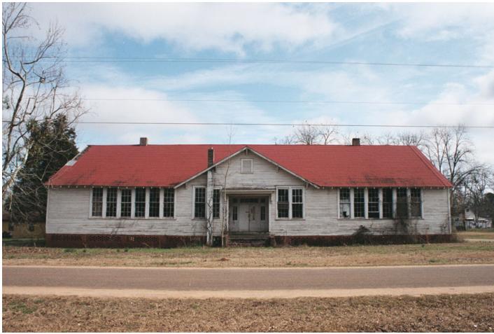
The Smithville Rosenwald School is an example of an intact four-classroom wooden building. When the school closed in 1955, it was converted to apartments. This photo was taken in 2005.