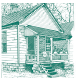
Georgia African American Historic Preservation Network

This publication has been financed in part with federal funds from the National Park Service, Department of the Interior, through the Historic Preservation Division, Georgia Department of Natural Resources. The contents and opinions do not necessarily reflect the views or policies of the Department of the Interior, nor does the mention of trade names, commercial products or consultants constitute endorsement or recommendation by the Department of the Interior or the Georgia Department of Natural Resources. The Department of the Interior prohibits discrimination on the basis of race, color, national origin, or disability in its federally assisted programs. If you believe you have been discriminated against in any program, activity, or facility, or if you desire more information, write to: Office for Equal Opportunity, National Park Service, 1849 C Street, NW, Washington, D.C. 20240.