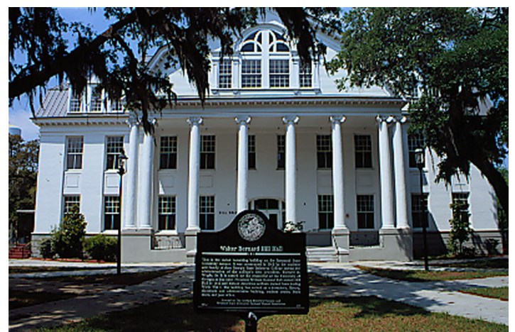
In 2001, the Georgia Historical Society and the Savannah State University National Alumni Association erected this marker in front of the entrance to Hill Hall.