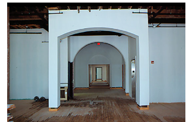
The main hallway on the interior first floor will lead students to enrollment services.