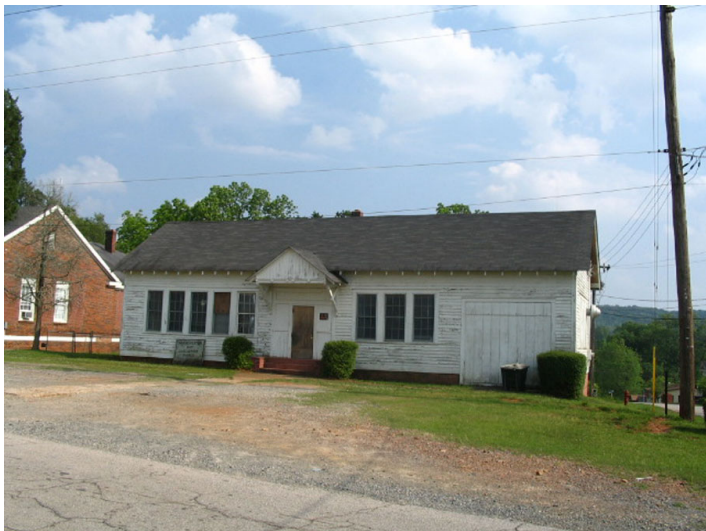
Sanborn Fire Insurance maps revealed an unusual pattern on the Manchester campus, as the brick building was identified first while the wooden building was denoted later. Like the brick building, the wooden building is adaptively used for community services.

After it was constructed, Manchester soon became a county training school, and enrollment soared. To accommodate this growth, the school constructed a separate annex located adjacent to the original brick building. While the exact date of this second building is not known, it appeared on a 1940 Sanborn Fire Insurance map, and was built sometime during the 1930s.