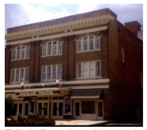
The Douglass Theatre, in downtown Macon, reopened in 1997, and hosts movies, music and stage productions.

The Douglass Theatre is located in Macon, Bibb County, in the Macon Historic District, listed in the National Register of Historic Places in 1974. Charles H. Douglass, an African American entrepreneur, founded the Douglass Theatre in 1921. During the Jim Crow era, there were no theatres accessible to African Americans in Macon. Douglass recognized the need for a