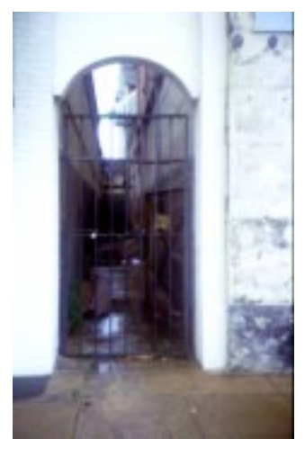
A steel gate to the left of the theatre's main doors was the entrance for African Americans during segregation.