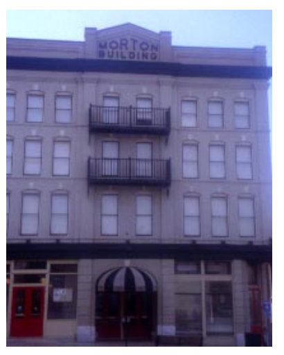
The Morton Building features businesses on the ground level. Double doors providing access to the Morton Theatre are on the left.

a $27,432 Historic Preservation Fund grant to assist the rehabilitation of the theatre in 1980. Monroe B. "Pink" Morton, a prominent African American contractor and businessman, constructed the building/theatre in 1910. The Morton Building featured storefronts on the ground level to accommodate African American businesses, an example of early 20th century mixed use commercial development. Morton owned 20-30 buildings in Athens, and was publisher of the Progressive Era , an African American newspaper. Many African American physicians, dentists and pharmacists had offices in the Morton Building, including Dr. Ida Mae Johnson Hiram, the first black woman to be licensed in the state of Georgia. The Morton Building and Theatre is located on Athens' "Hot Corner," a popular gathering place for African Americans since the late 19th century. "Hot Corner" today includes the Morton Building on Washington Street and Wilson's Styling Shop, the Manhattan Café and Wilson's Soul Food on adjacent Hull Street.