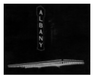
The Albany Theatre marquee at night.

The Albany Theatre, built circa 1927, was southwest Georgia's leading movie house and center for the performing arts. With a seating capacity of 2,000, the auditorium provided entertainment for Albany residents in Dougherty and surrounding