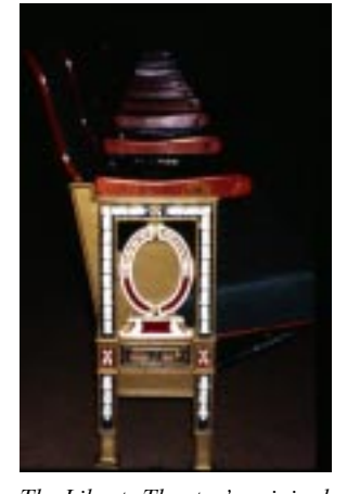
The Liberty Theatre's original seats bear contributors' names on brass plates.

Register of Historic Places for these properties provide baseline data for Chitlin Circuit structures and performers. The Georgia African American Historic Preservation Network is conducting further research to identify other theatres or structures used by Chitlin Circuit artists. The Chitlin Circuit research project will help to raise awareness for buildings utilized as performance venues for this important aspect of Georgia's African American heritage. Should readers have any photos or documentation of Chitlin Circuit structures and performers, please contact Jeanne Cyriaque, Reflections editor (see page 7).