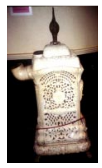
The Morton Theatre's original, cast iron "pot belly" stove.