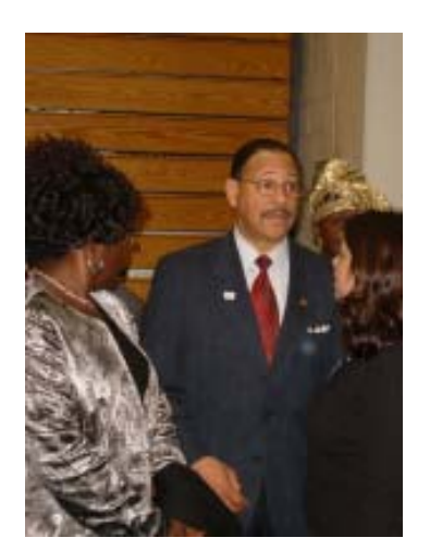
Congressman Sanford Bishop

up and fight against the struggles to overcome racial, economic, and gender discrimination in the rural South. She affirmed sisterhood and stated: "I love and appreciate black women who have done so much for me – who have help to keep my feet firmly planted on the ground."