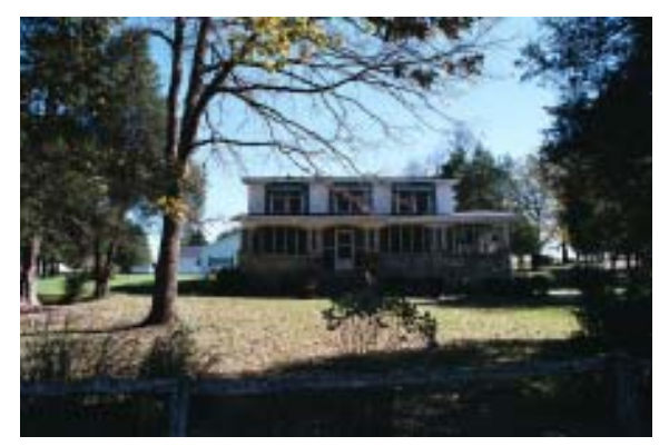
The Haslerig family homeplace still exists on their propertytoday.

Chickamauga Masonic Lodge #221 is the site of the African American Veterans of Foreign Wars Camp that was established after World War II by Walker County veterans who could not participate in other camps due to segregation policies. The lodge hall is also the meeting place for the Esther Chapter #476 Order of Eastern Star. The chapter received their charter in 1944.