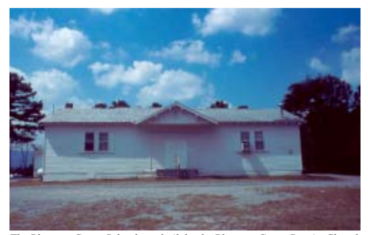
The Pleasant Grove School was built by the Pleasant Grove Baptist Church in 1931. It is a contributing resource in the McLemore Cove Historic District, and was listed in the National Register of Historic Places on August 11, 1994.

The association is preserving the Chickamauga Lodge #221. The Prince Hall Masonic Temple in Atlanta and African American Masonic