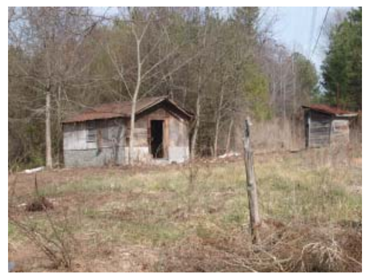
A smokehouse and outhouse still exist behind the Flat Rock Archive today.

community in Flat Rock at a time when changing social roles, urbanization, industrialization, and northern migration presented attractive alternatives to rural farm life. The property contains outbuildings that were utilized until the 1950's: a barn, a smoke house, and outhouse. During slavery, whites, enslaved African descendants, Native Americans, and free men and women of color all lived in the area. Johnny Waits said, "Flat Rock was located on the South River, the dividing line between Henry and DeKalb counties. There were river barges all along the South River, and of course farming. But by 1848, industry shifted from the river to the railroads. And, also there were the quarries."