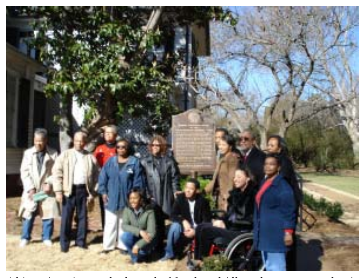
African Americans who have the Marsh and Allgood surnames gather in front of the historic marker that recognizes the African American pioneers associated with the Marsh-Warthen-Clements House.

The Helping Hands: In Service at the Marsh House Committee has become an integral part of the interpretation initiative, as they document the Native and African American heritage of the Marsh-Warthen-Clements House. In February 2008 the committee unveiled a historic marker that commemorates the African American contributions to the Marsh-Warthen-Clements House. The marker was placed in front of the servants' quarters that comprised the east wing addition of the house.