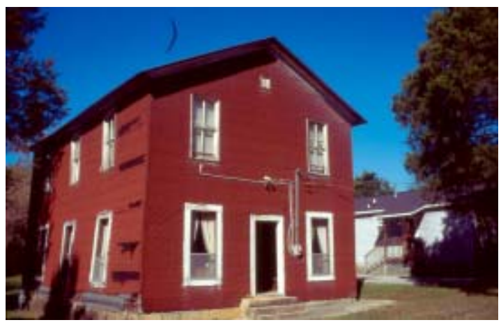
When Chickamauga Masonic Lodge #221 was awarded a pre-development Georgia Heritage grant, red asphalt siding covered the building. The lodge is a Prince Hall affiliate, Free and Accepted Masons.

lodges in Chickamauga and Dalton are listed in the National Register of Historic Places. Chickamauga Lodge #221 has received two Georgia Heritage grants from HPD to preserve this building. The pre-development grant created a preservation plan in 2005. The plan pointed out structural deficiencies in the building that required immediate stabilization. In 2007, Chickamauga Lodge #221 received a $20,000 development grant to rehabilitate the structure and address safety concerns for public use.