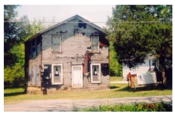
The preservation plan revealed several structural deficiencies and safetyissues. The red asphalt siding was removed and revealed the originalwood siding.

The Chickamauga Masonic Lodge #221 is a two-story, wood frame structure that was built by lodge members. It is the only remaining African American Masonic lodge in Walker County. The lodge hall's first floor space is used for community meetings, while the second floor is reserved for the Masons and Eastern Star meetings. The original handcrafted Masonic stations and pedestals occupy this space. The lodge was also the meeting space for the African American Odd Fellows of Chickamauga. In 1952, red rolled asphalt siding was added to the exterior, along with plumbing and heating. A cornerstone on the building's exterior denotes these changes.