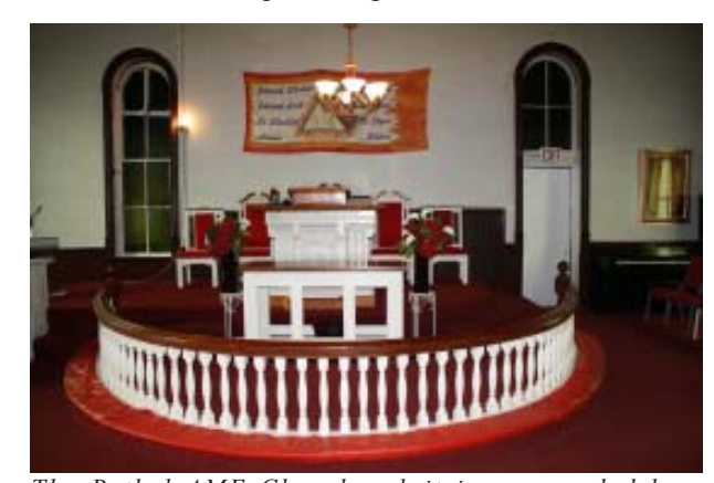
The Bethel AME Church pulpit is surrounded by a nineteenth century balustrade where worshipers can kneel to pray and receive communion.

In 2012, Bethel AME partnered with the City of Acworth, Cobb County Historic Preservation Commission, Georgia African American Historic Preservation Network, Turner Chapel AME, and Cobb Landmarks to work toward compiling a restoration plan for the church. This plan aims to protect the structure by taking necessary steps to prevent water damage, maintaining and preserving existing windows and doors, and preserving the historic interior.