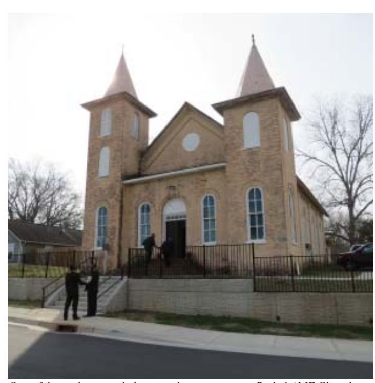
One of the architectural elements that is present at Bethel AME Church are its asymmetrical towers. One tower includes a cast iron bell that was rung as guests arrived.

Bethel AME Church, located in Acworth, Georgia just north of Atlanta, was founded in 1864 by former slaves in the Acworth area. After its inception, Bethel shared a building with Zion Hill Baptist Church and alternated Sunday services. By 1871, Bethel's church trustees purchased an acre of land and added another parcel in 1882. Much of the church is believed to have been built around the period that the land was acquired between 1871 and 1882. The