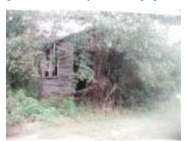
A tree had grown inside the rear classrooom of the Barney School.

MRAA held numerous fundraisers like fish frys and quilt raffles along with alumni donations to raise matching funds for grants, but they also engaged corporate community support to