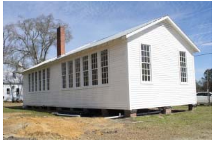
Each classroom in the Barney School features clusters of six banks of nine-over-nine windows.