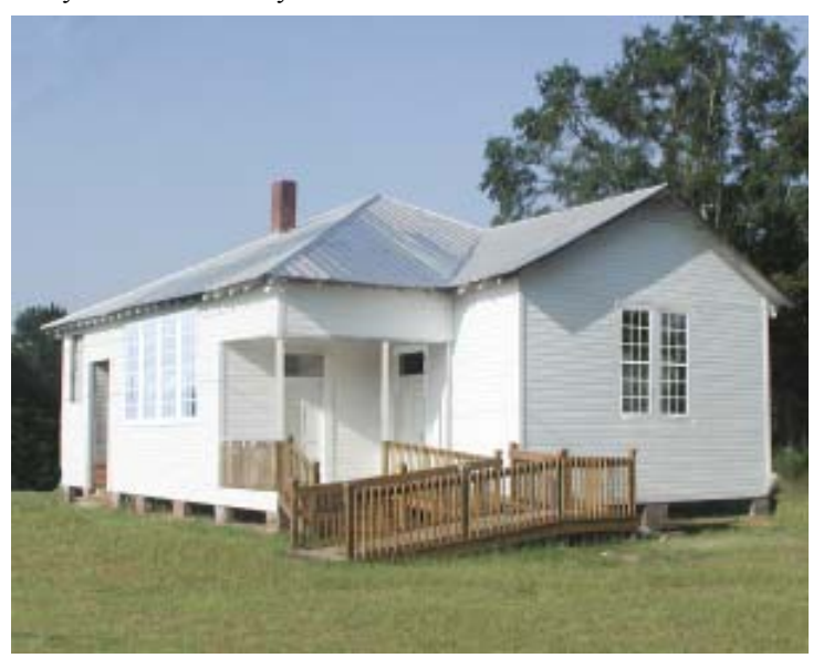
Barney Colored Elementary School was constructed in 1932 and served this rural community until 1959. It was preserved by the Morven Rosenwald Alumni Association.

When Barney Colored Elementary School closed in 1959, it remained vacant until 2006, when the Morven Rosenwald Alumni Association (MRAA) acquired it. As former Morven alumni hosted class reunions, they became interested in the fate of their feeder school since they had lost their Rosenwald building. As alumni attended the first Rosenwald School conference sponsored by the National Trust for Historic Preservation at Fisk University in 2004, they continually perused possible funding sources for their project, while examining what other states had achieved to reclaim their Rosenwald Schools.