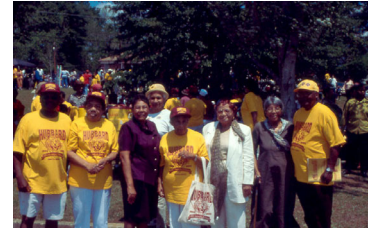
Hubbard alumni proudly wear their school t-shirts on parade day.

The Hubbard Alumni Association is working closely with the Middle Georgia Regional Development Center to implement a $500,000 redevelopment grant for adaptive reuse of the women's dormitory as a community center. The first floor will be used as a museum while preserving one dormitory room and providing office space for the Hubbard Alumni Association. The plan outlines use of the second floor of the building for a job skills training center for the community. For more information, visit their website at www.hubbardalumni.org .