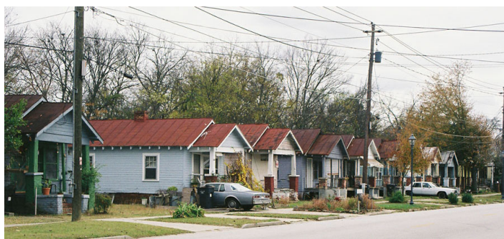
Shotgun houses are common throughout the residential sections of the Bethlehem and Laney-Walker Historic Districts in Augusta.