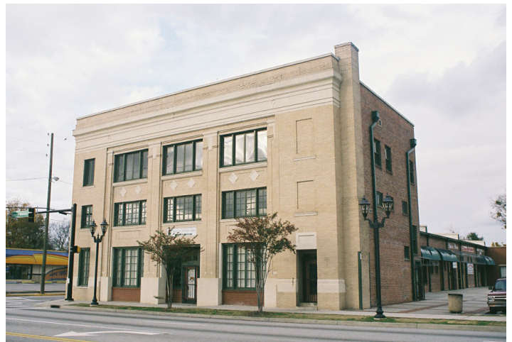
Penny Savings Bank is a community landmark building in the Laney-Walker Historic District. Its historic use was as a banking institution for African Americans and it is adaptively used for commercial purposes today.