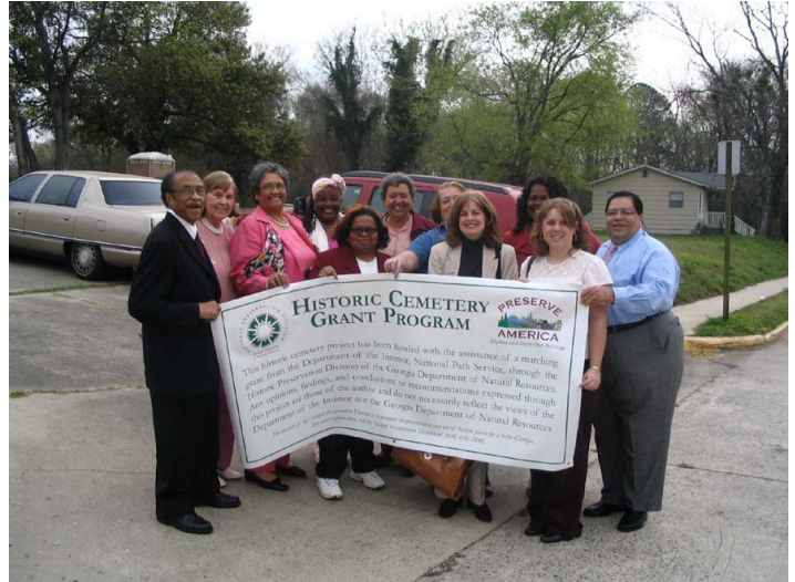
Preservationists celebrate the Preserve America grant at Linwood Cemetery in the Pleasant Hill Historic District in Macon.