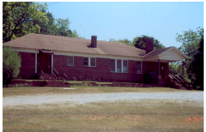
The Teachers' Cottage was built during the Great Depression with the financial assistance of the Julius Rosenwald Fund. It is the only teachers' cottage that currently exists among the 43 surviving Rosenwald School buildings that have been located by African American programs. The Teachers' Cottage and the Women's Dormitory were listed in the National Register of Historic Places on May 30, 2003.

What became of the historic buildings that are a significant part of the Hubbard legacy? The women's dormitory continued to be used for a number of years to provide housing for teachers as part of the Exchange Teachers Plan and for a time after the fire the first floor served as classrooms and housed the school library. By 1970, all buildings constructed during the STAC era disappeared from the landscape except for the women's dormitory, president's home and the teachers' cottage.