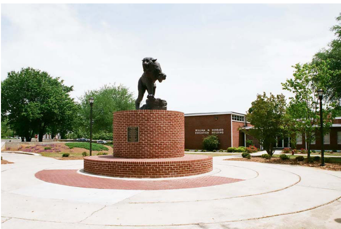
The William M. Hubbard Education Building at Fort Valley State University is located behind the "Wildcat" sculpture on the campus.