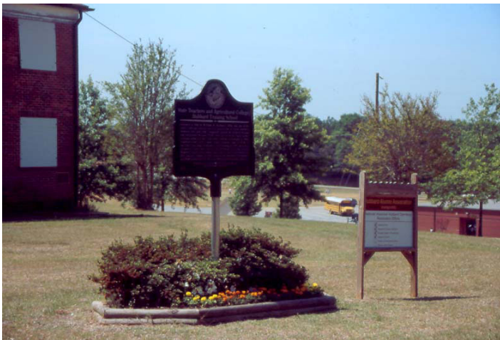
The Hubbard Alumni Association, in partnership with the Georgia Historical Society, erected this marker in 2003 on the side of the campus that faces Georgia Highway 83. The marker provides visitors with a short history of both the State Teachers and Agricultural College and its transition to the Hubbard Training School.

In the tradition of the school's founder, the Hubbard Alumni Association cultivated partnerships with the Monroe County Board of Education to preserve the Hubbard Women's Dormitory and revitalize it for use as a museum, training and cultural center. This building along with the teachers' cottage were subsequently listed in the National Register of Historic Places on May 30, 2003. This recognition paved the way for a new relationship with the Historic Preservation Division.