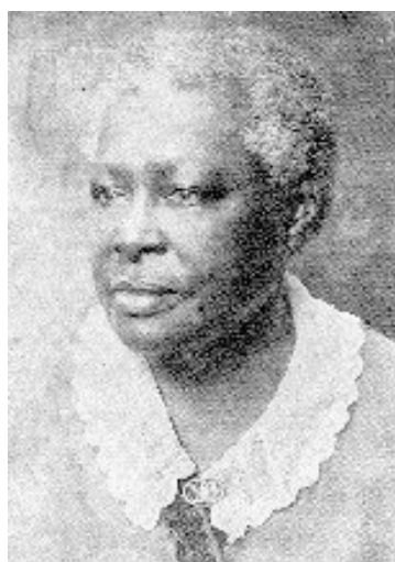
Lucy Craft Laney

In 1886, the school was chartered by the State of Georgia and Miss Laney, the faculty and students moved into its new location at 800 Gwinnett Street, now Laney-Walker Blvd. Sixty years later, Haines Normal and Industrial Institute closed due to declining enrollment. The Cauley-Wheeler Memorial Building is the only extant building of the former Haines Normal and Industrial Institute. This building sits behind the modern Lucy Craft Laney Comprehensive High School, named in honor of its founder. Lucy