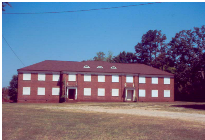
The Women's Dormitory is one of the historic buildings that remain from the State Teachers and Agricultural College era when the school was one of Georgia's three African American institutions in the University System of Georgia. The dormitory was constructed in 1936.

students and operated a farm on 300 acres of land.