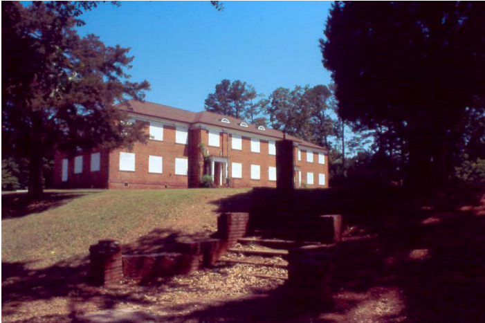
This view of the Women's Dormitory illustrates the brick stairs that once were the entrance to the various buildings that comprised the historic campus of the State Teachers and Agricultural College for Negroes.