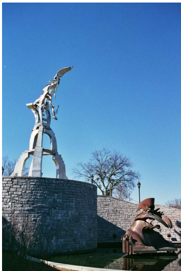
Two sculptures designed by Richard Hunt are elements in Springfield Village Park.