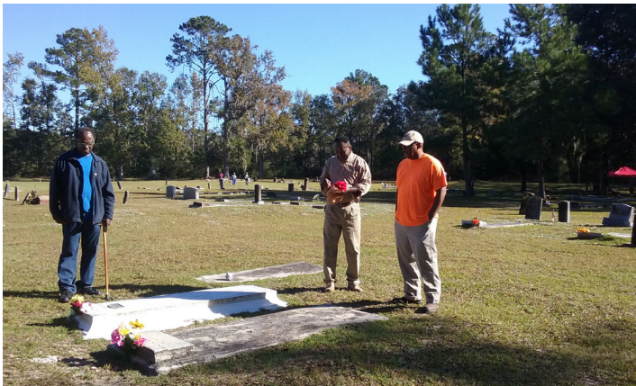
Church and family members help maintain the park-like grounds.