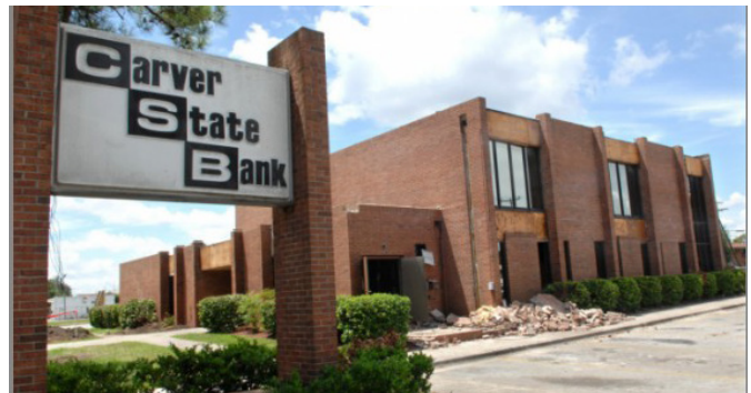
Former West Broad Street branch demolished in 2010 for new building