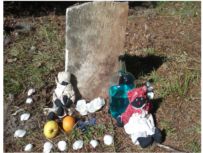
These grave goods used to honor ancestors reflect African traditions.

As well maintained as the cemetery is, church property manager Elder Willie Mae Washington is acutely aware of the depressions in the cemetery ground that are probably unmarked and unidentified graves. Working with a landscaper, she pays particular attention to the cypress trees on the property as some were planted to indicate a grave when people could not afford a headstone. The church is committed to identifying unmarked graves and connecting family members to relatives buried in this sacred space.