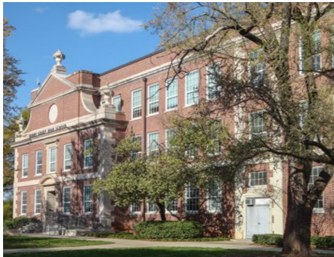
Henry Grady High School, built 1922-24 as Boys High, renamed in 1947

the federal busing mandates that sought to provide educational equality for low-income minority students. What started out as an effort to fit the needs of a majority of blacks came to benefit the upper echelon of middle class blacks. After a few attempts to fully desegregate Atlanta public schools, the white power structure made blacks choose the benefits of a few over the needs of the masses. Benjamin E. Mays, a member of the black middle class, saw that the struggle to create equal opportunities for low-income black students would be a long and arduous battle. So instead, his organization decided that immediate opportunities for advantaged black teachers was a sufficient victory in the overall fight for desegregation. Maybe they would revisit the battle for further integration in the future. Unfortunately three decades later, Atlanta still remains a city that suffers from educational segregation along race and class lines.