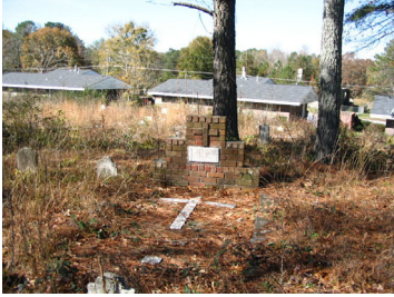
This grave enclosure is made of red bricks with a cross on the headstone and grave.