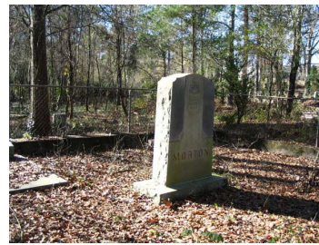
The Morton family plot is enclosed by a chain link fence.

appearance. Today, the site is on a major road surrounded by homes and social services that links the East Athens community to downtown businesses. Gospel Pilgrim Cemetery remained the principal Athens cemetery for African Americans until the 1970s, when integration presented new burial options for the community.