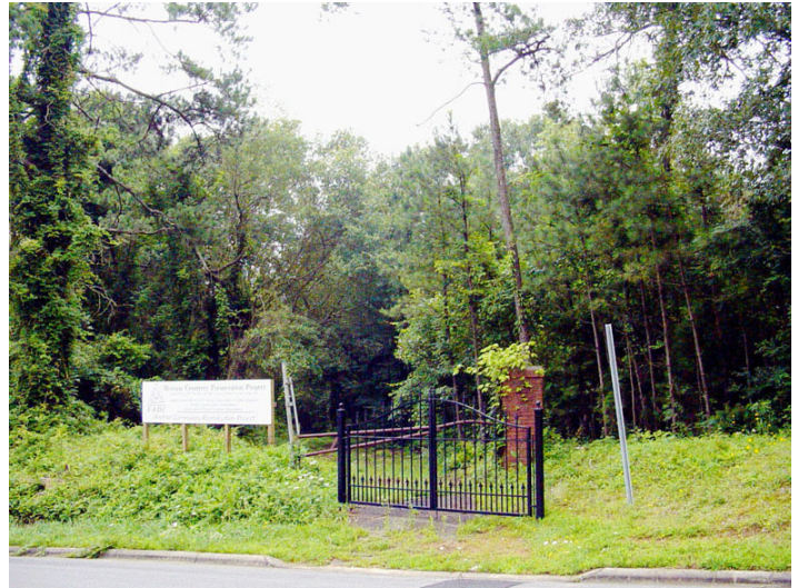
In August 2003, this was the gate at the main entrance to Gospel Pilgrim Cemetery before the master plan was implemented.

EADC, with the support of the community, decided that this cemetery was an important resource that should be utilized as a green space and historic site. They secured funds for the revitalization of the cemetery from the Georgia Department of Labor to provide jobs for residents of the East Athens community for cleaning, perpetual care, and interpretation of the site. EADC hired The Jaeger Company (TJC) and Southeastern Archeological Services (SAS) to create a master plan, a guide that outlines and provides information on the steps needed to implement their revitalization initiative. The primary goal for EADC was the revitalization of the cemetery. Fieldwork was undertaken by SAS to determine the number of burials and map the road network of the