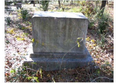
William Pledger's gravestone is located near the main entrance to Gospel Pilgrim Cemetery.

When the Gospel Pilgrim Society ceased operations in the 1970s, individual family visitation and maintenance declined, and Gospel Pilgrim Cemetery gradually deteriorated. By 1986, the community began efforts to remove debris from the site. In 2002, Gospel Pilgrim Cemetery was so neglected that community volunteers removed 30 tons of garbage from the site. At that time, the City of Athens and the East Athens Development Corporation (EADC) began a series of preservation initiatives. A metal gate was installed in 2003 to limit trespassing in the cemetery. EADC enlisted the services of The Jaeger Company and Southeastern Archaeological Services to develop a master plan for cemetery preservation. The archaeological investigation documented 100 marked graves and estimated up to 3,000 unmarked graves from depressions throughout the cemetery.