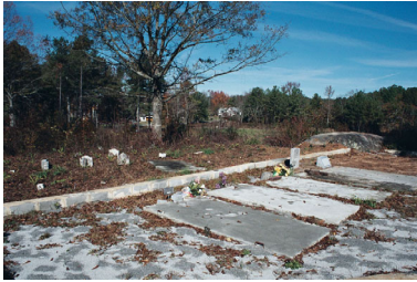
This family plot is surrounded by a concrete wall.

Many African Americans lived in a community adjacent to the Lithonia One Cemetery known as Bruce Street. This community was established around 1895. Former slaves, farmers