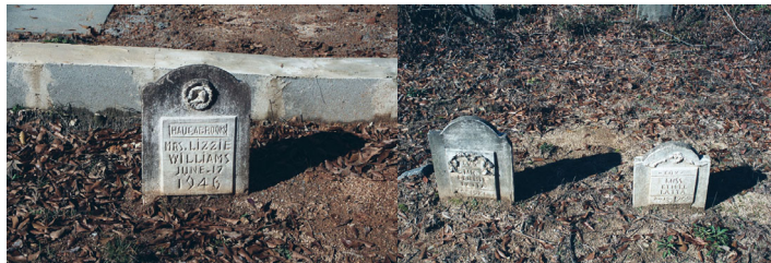
Some headstones are provided by African American funeral homes, such as Cox Brothers and Haugabrooks.