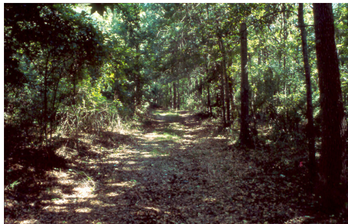
The landscape of Gospel Pilgrim Cemetery consists of numerous mature trees surrounding gravesites along unpaved roads.