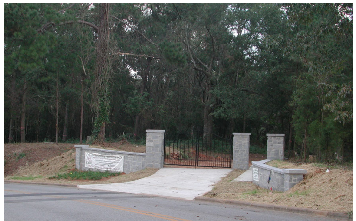
In October 2004, a new gate was unveiled at the main entrance to Gospel Pilgrim Cemetery after implementation of Phase One of the master plan. Fallen trees and overgrowth were removed to reclaim the earlier 20 th century wooded appearance of the cemetery.

Once the master plan was completed, EADC secured funds to clean up and secure the cemetery. When Phase One was completed, EADC unveiled a new entry gate on October 11, 2004. The new gate secured the site and deterred illegal dumping of trash. With the master plan to guide them, EADC is focusing on Phase Two. This phase will include resurfacing of the road network with pedestrian paths and limited vehicular use.