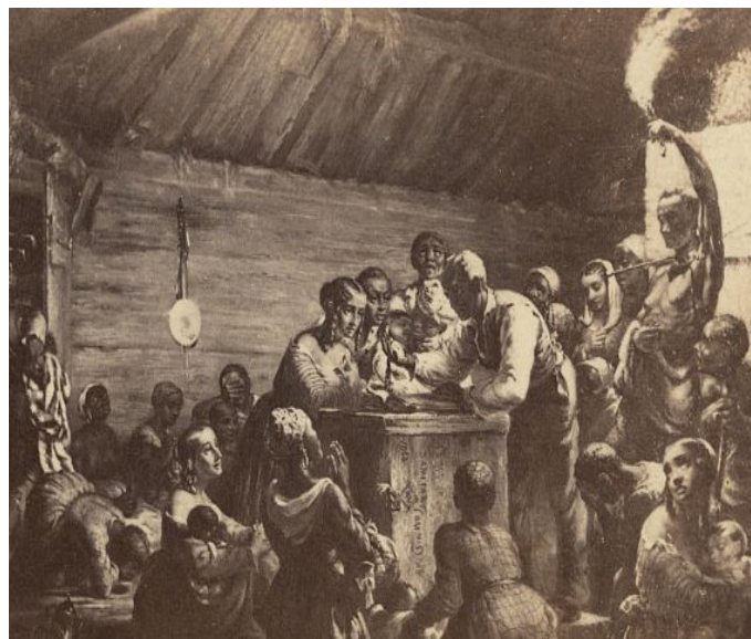
Watch Night Meeting, Dec. 31, 1862: Waiting for the Hour

Once the Civil War ended and freedom had been granted, the newly freed Africans began to create their own communities and congregations that continue to participate in Watch Night. Over the decades these celebrations have become a part of the rich Gullah Geechee heritage that black churches and institutions have kept alive. 2