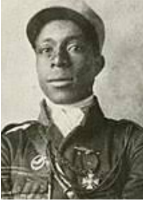
Eugene Bullard, native of Columbus Georgia Wikipedia.org

Georgia played a significant role during America's participation in World War I (1917-18). It was home to more training camps than any other state and (by the war's end) it had contributed more than 100,000 men and women to the war effort. Georgia had five major federal military installations when the US entered the war. Georgians also suffered from the effects of the influenza pandemic, the tragic Otranto maritime disaster, local political fights, and wartime home-front restrictions. 1