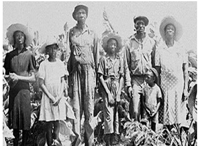
Sharecroppers in Bulloch County

Many black men were arrested and placed in camp stockades for not heeding draft notices that they had never received from landowners. For most of the war, local draft boards "resisted sending healthy and hard-working black males" because they were needed in the cotton fields and by the naval stores industry. 5