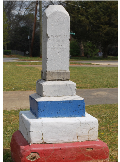
The Shiloh WWI Monument

The Centennial Commission's expectation is that these public databases of names and memorials will form the most comprehensive listing of Georgia's fallen soldiers – both Black and White – and be a tribute to them and their families for ultimate sacrifice they made one hundred years ago in World War I – and be forgotten no longer.