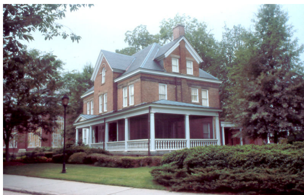
Prior to construction of Reynolds Cottage in 1901, the seminary's co-founders lived in the barracks. It has remained the president's home for over 100 years.