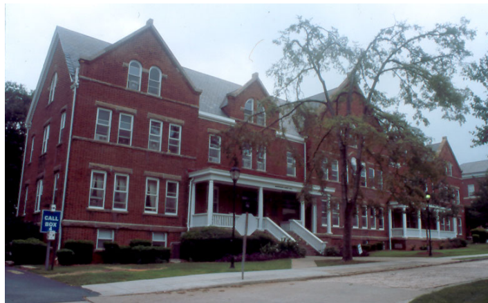
Morehouse-James Hall (1901) has consistently been used as a dormitory. It was renovated in the 1970s to provide housing for 85 students.