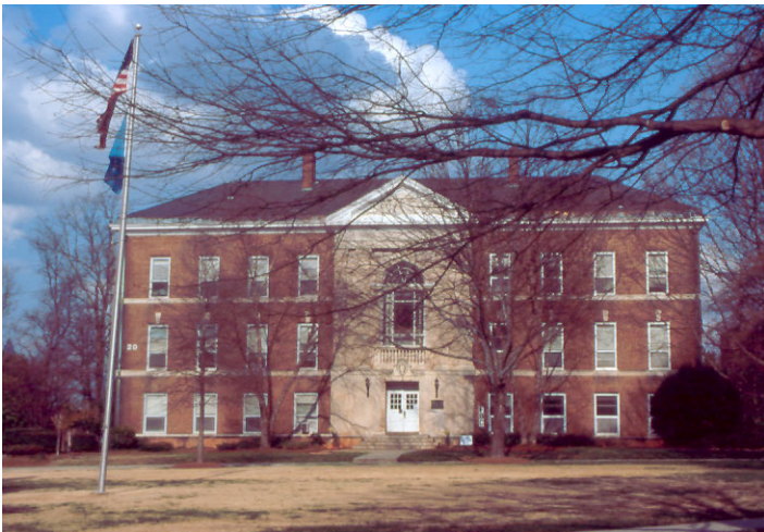
Laura Spelman Rockefeller Hall (1918) is a dormitory today and is the home of the Child Development Center.