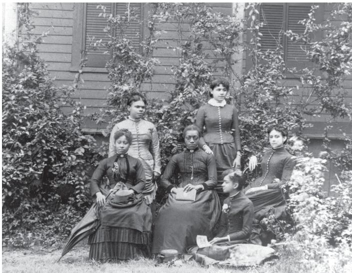
This historic photo depicts the 1887 Spelman Seminary High School graduates.

At first, instruction at the Seminary focused on the alphabet and children's bible studies. From this modest beginning, news of their success spread rapidly in the African American community, and by the end of the school's first year, enrollment had increased