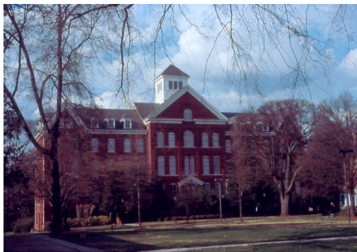
Giles Hall is a five-story, T-shaped building that is the anchor of the north end of the historic Campus Oval. The building's historic use was to provide housing and classrooms. Today, it is a multipurpose academic building.