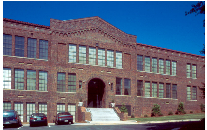
The historic Croghan School is located in the Pittsburgh Historic District. The building is adaptively used as loft apartments today and provides housing for community residents.