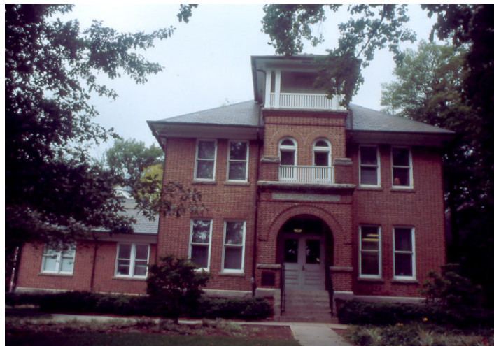
MacVicar Hall (1901) was renovated in the early 1990s. Today, services include counseling and the Women's Health Clinic.