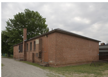
The Cauley- Wheeler building is the sole historic building on the modern Lucy Craft Laney High School campus.