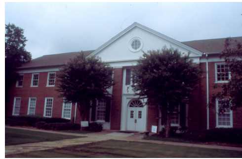
Read Hall (1951) still serves as the recreational facility for Spelman College.