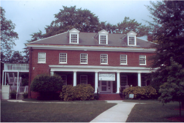
Bessie Strong Hall (1917) was named in honor of John D. Rockefeller's oldest child. Its historic use was a residence for nursing students. It is currently a dormitory.

from ABHMS to the school. Her crowning achievement occurred in 1924, when Spelman Seminary became Spelman College.