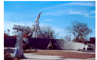
And They Went Down Into the Water and the Tower of Aspiration are two sculptures designed by Richard Hunt in the Springfield Village Park.