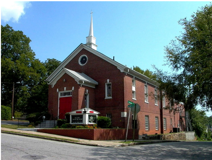
Ariel Bowen Church is a community landmark building in the Pittsburgh Historic District.

With the railroad providing a constant source of employment and the continuance of segregation, many African American institutions, including businesses, churches and schools, developed throughout Pittsburgh. Shortly after Pittsburgh was settled, residents began holding Sunday School and Bible Study classes in their homes. These classes eventually led to the founding of Ariel Bowen (United Methodist) Church and Iconium Baptist Church.