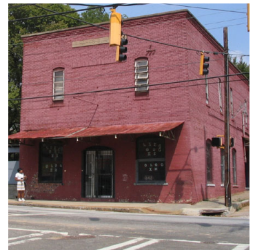
This historic structure is one of the surviving historic buildings that still exist on McDaniel Street in the Pittsburgh Historic District.

By 1960, Pittsburgh contained over 9,000 residents. However, the population as well as housing began to decrease due to transportation and urban renewal projects. During the 1950s, in order to provide easier access to Atlanta's business district, a new expressway system was proposed and designed. This new design not only affected Pittsburgh, but many of Atlanta's African American neighborhoods. While the impact in other neighborhoods was not as severe in Pittsburgh, a number of houses were destroyed as well as the commercial district.