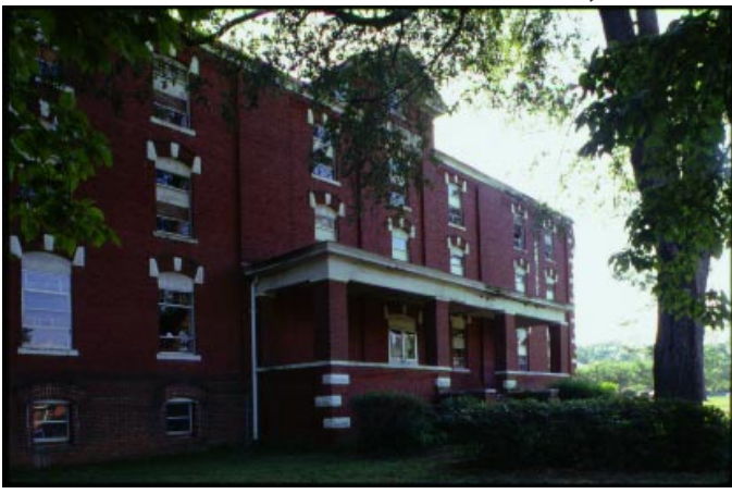
Huntington Hall, c.1908, was a gift from C.P. Huntington. The building was utilized as a dormitory for girls. It is the oldest building on campus, erected with the assistance of student laborers.

Washington Park is a key recreational area in this African American community characterized by historic bungalow residences, commercial structures and landmark buildings. The Washington Park Historic District is located