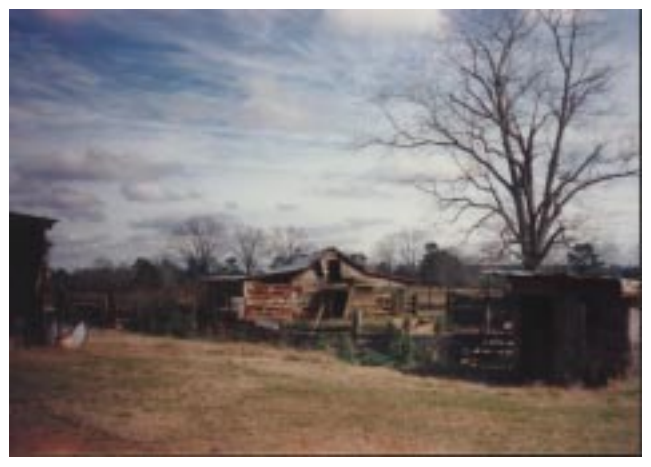
The Morgan family farm historic outbuildings include a smokehouse, cotton barn, hog pen, mule barn, corn crib, and hen house.