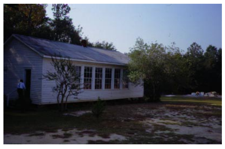
Green Grove School is an example of a one-room school typically used to educate African American students in early 20th century rural Georgia. The windows provided a natural light source in this wood frame building. The school is presently used for church functions, special classes and family reunions.

years later this building was destroyed by a fire. A new church, New Green Grove, the present building, was completed in 1927. The church held classes for ten years until 1937, when the Wesley Chapel school for white children closed. This school was purchased by the Green Grove trustees, who disassembled the building and moved it four miles by wagons to the present location. These black craftsmen, including Johnny Hudson, currently a master craftsmen at nearby Westville Village, Oscar Powell, and other church members carefully reassembled the school piece by piece, completing it in time for fall classes. This was truly a remarkable feat!