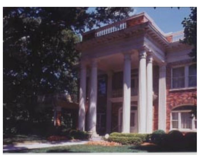
Visit The Herndon Home, 587 University Place N.W., in Atlanta. Tours are conducted hourly from 10 a.m. to 4 p.m. Tuesday through Saturday. Admission is $5 for adults, and $3 for students. Group rates are available. For group tour reservations and further information, call 404/581-9813.

As an African American male from rural Georgia, touring this historic property left me in awe of every aspect of the home, including its structure, furnishings and landscape. Be sure to tour this grand historic place next time you are in Atlanta.