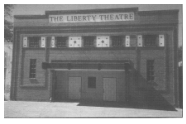
The Liberty Theatre opened in 1925 as the first African American entertainment center in Columbus. When it was no longer used as a movie house and the building deteriorated, the Liberty closed in 1974. The Liberty Theatre was listed in the National Register of Historic Places in 1984. Restored by 1997, it presently serves the African American community as the Liberty Theatre Cultural Center.