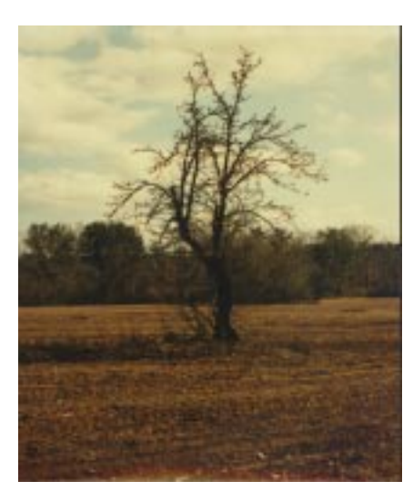
A pear tree on the Lewis Clark farm in Boston.

only one in seven black farms was operated by owners, and only one in five acres of farmland in the state was blackowned." The Georgia Historic Resources Survey documented fewer than ten African American-owned farms in 38,000 properties. The accomplishments of these three families are extraordinary, given the historic economic barriers