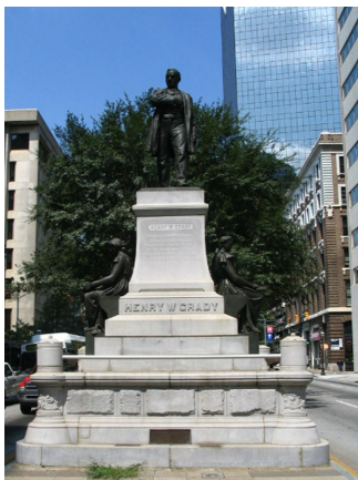
Three African Americans were killed during the 1906 Atlanta Race Riot near the site of the Henry Grady statue on Marietta Street.

There are a number of notable sites affiliated with the 1906 Atlanta Race Riot . Five Points is a landmark downtown intersection where violent white crowds gathered before chasing and attacking blacks on surrounding downtown streets. Near the Henry Grady statue on Marietta Street, rioters paraded and laid the beaten and bloody bodies of three slain black victims. South View Cemetery is the resting place of many of the African American victims of the riot. Brownsville (now known as South Atlanta) was a black upper-class neighborhood that armed and defended itself against white rioters who raided their community on Monday, September 24, 1906. The Gammon Theological Seminary/Clark University (now the campus of the New Schools of George Washington Carver) was formerly located in this neighborhood.