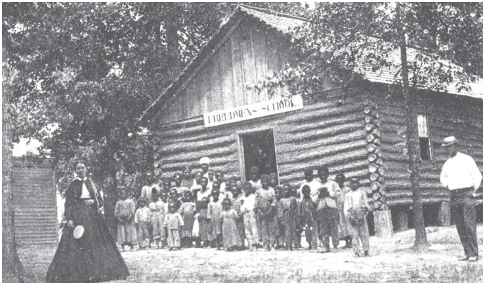
This photo of a Freedmen's School in rural North Carolina appeared in the University of California, Davis History Project Collection, and is cited in the U.S. National Archives, Washington, D.C.

Long before emancipation, enslaved people always aspired to educate themselves and their children. Whether through the assistance of abolitionists or stealing away to a literate slave's quarters, education was a cause for which many risked life and limb to acquire. In the post-bellum era, various organizations such as missionary aid societies and fraternal lodges offered their meeting places as makeshift schools, pointing to their deep commitment to education, the drive of the teachers, and the resourcefulness of the community. Schoolhouse construction was a community event with numerous families responding to the call for education for black children. The manifestation of black schoolhouses on the southern landscape was a loud call for social change – calls that