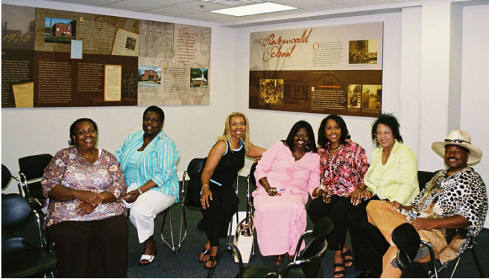
Alumni from the last graduating class are seated in front of the permanent exhibit at the Summer Hill Museum. The exhibit is located in the recreational complex.