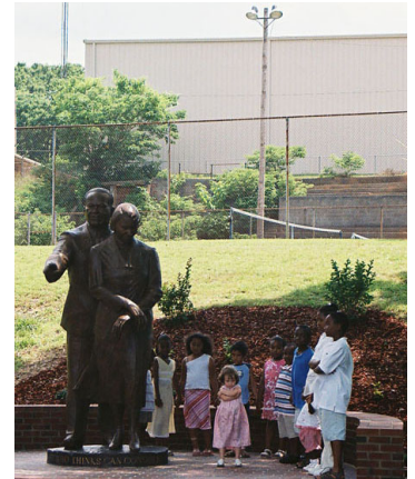
Teacher resource kits were created as part of the Summer Hill Project for Bartow County students to experience Summer Hill in the classroom and on-site.