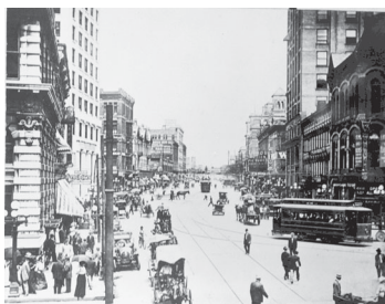
This circa 1906 Atlanta street scene depicts the Henry Grady statue that still exists on Marietta Street today.

In his poem A Litany of Atlanta W. E. B. DuBois penned these words after hearing of the outbreak of a bloody race riot in Atlanta: