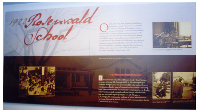
One of the panels in the permanent exhibit depicts images from the Summer Hill Rosenwald School.