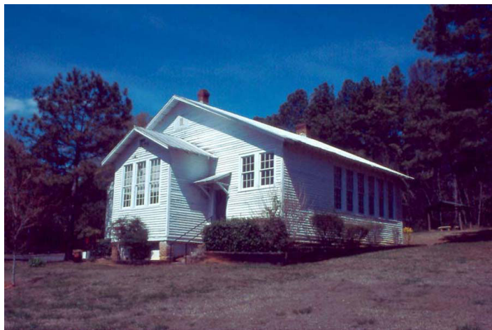
The Noble Hill Rosenwald School was listed in the National Register of Historic Places on July 2, 1987.

As time went on, things changed and opportunities changed. Our superintendent, he was very supportive. Of course, you know superintendents were still white. I tried not to be too selfish – that is, to have all the things happen to black schools with nothing in particular happening in the white schools. And they began to see what was happening in the black schools and it made them interested in calling me, getting in touch, finding out how to do some of the other things. Quality was one thing, but we had improved our black schools to the point that there was a question among the white schools as to why were getting ahead so much faster. And that was the thing that, I think, encouraged integration. And our superintendent was for this. And by the way, at that time if you were integrating, you would be set up for more funding from sources. And of course, that made my superintendent ready to do that. It was through this superintendent that we got things done. He believed that integration was something we should strive for.”