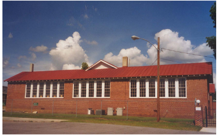
The Thomas Jefferson Elder High and Industrial School was listed in the National Register of Historic Places on May 12, 1981. The Washington County Elderite Alumni Association are stewards of this historic school in Sandersville. The school is presently known as the T.J. Elder Community Center.