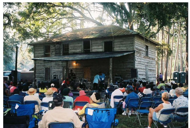
Farmers Alliance Hall is the central venue of the Sapelo Island Cultural and Revitalization Society (SICARS) annual Cultural Day at Sapelo Island.