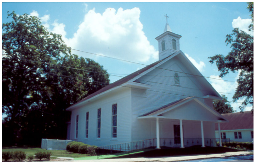
Brunswick's First African Baptist Church is the program site for the Georgia African American Historic Preservation Network's annual meeting.

Participants are encouraged to arrive early for an evening opening reception on June 8th. The annual meeting workshops will be held all day on Friday, June 9th. at the historic First African Baptist Church.