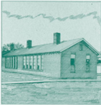
This rendering of two of the classrooms in the T.J. Elder School illustrate the windows that were defining features in a Rosenwald School.