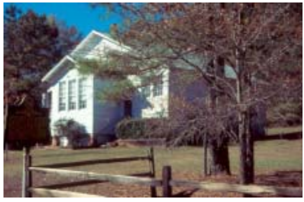
A case study of the Noble Hill School in Cassville (Bartow County) is featured in Preserving Rosenwald Schools. The school was listed in the National Register of Historic Places in July 1987. The school is adaptively used as the Noble Hill-Wheeler Memorial Center, a heritage museum.