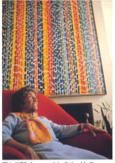
This 1975 photograph by Roland L. Freeman appeared in Alma W. Thomas: A Retrospective of the Paintings.

The Alma Thomas residence in Washington, D.C. is a contributing resource in the Logan Circle Historic District that is listed in the National Register of Historic Places. It is included in the African American Heritage Trail , a recent publication produced by Cultural Tourism DC with grant support from the DC Historic Preservation Office. The trail guide also features the old Shaw Junior High School, where Thomas taught from 1924-1960. In 1982, the Asbury United Methodist Church converted the old Shaw school building into senior citizen housing. For more information, visit www.CulturalTourismDC.org.