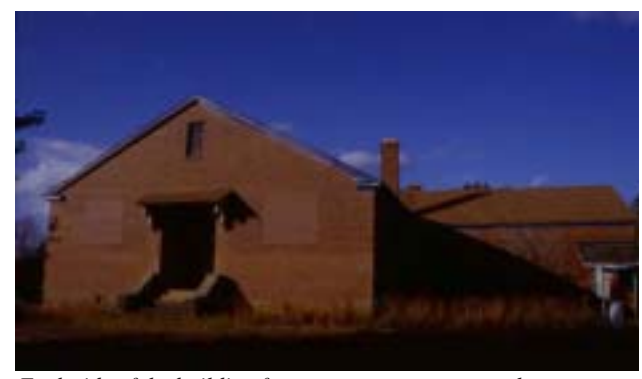
Each side of the building features entrances to two classrooms.

story was used as a lodge hall and the first floor was petitioned off for a two-room school."