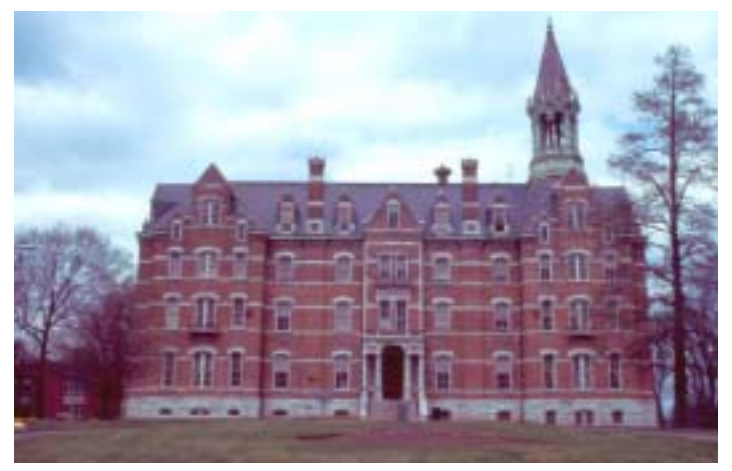
Jubilee Hall was constructed in 1876, and was one of the first brick buildings on the Fisk University campus. This National Historic Landmark was named in honor of the Fisk Jubilee Singers.

Mark your calendars for Reclaiming Rosenwald Schools: Preserving a Legacy , a conference to be held May 21-22, 2004 at Fisk University in Nashville, Tennessee. Sponsored by the National Trust for Historic Preservation's Rosenwald Schools Initiative, and hosted by Fisk, the conference will feature educational sessions, tours, an exhibit and resource room, and time to network with other Rosenwald school preservationists. Reclaiming Rosenwald Schools will bring together preservation professionals, community activists, scholars and individuals interested in finding out more about Rosenwald schools and how to preserve them.