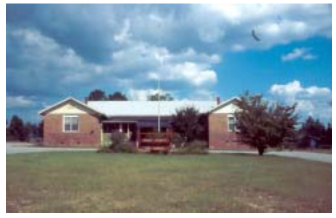
Vienna High & Industrial School (Dooly County) was built in 1926. The building was continuously used as a school by the Dooly County Board of Education, and Pre-School classes were held in this building until the end of the 2003 academic year.

The historic campus of Fisk University is home to the Rosenwald Fund's archives. Housed in Special Collections at the John Hope and Aurelia Franklin Library on campus, the collection is invaluable to anyone researching a particular school, or the Rosenwald school building program in general. A session featuring the collection's contents will be held at Reclaiming Rosenwald Schools . Research times will be scheduled before and after the conference.