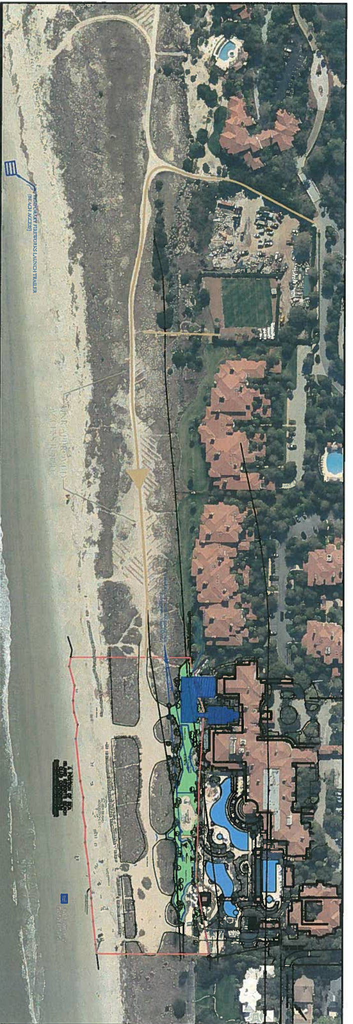
AERIAL TAKEN 3/8/2016

DNR LETTER OF PERMISSION (LOP) EXHIBIT B Sea Island Beach Club