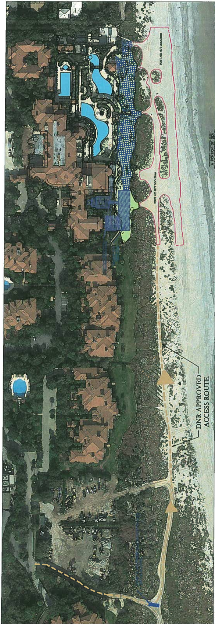
GOOGLE AERIAL 1/25/2019