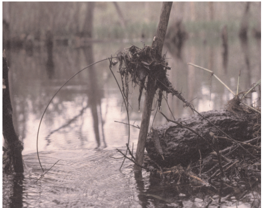
Example of a snare

For a description of all the trapping regulations in Georgia, contact your local WRD Game Management Section office. Trapping regulations also can be found on the WRD Web site at www.gohuntgeorgia.com .