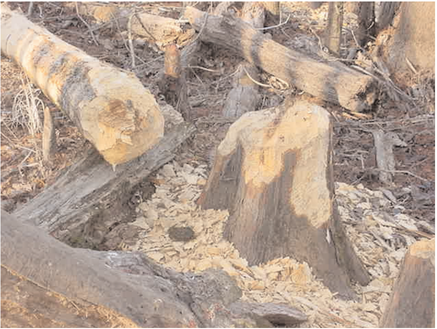
Example of typical beaver cuttings in Georgia