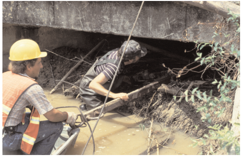
Highway department unclogging a culvert plugged by beavers

In recent times, beavers are considered by some to have more negative economic impacts than positive. Flooding caused by dams may result in damaged timber, crops or pasture. Highway departments may spend thousands of dollars every year attempting to clear beaver plugged culverts or paying trappers for nuisance beaver removal. When feeding, beavers girdle and destroy trees and shrubs, some of which are highly valued and expensive. Beavers will feed on agricultural crops, especially corn and soybeans, resulting in diminished yields for the farmer. Beavers often may damage fish and farm ponds through den and dam construction.