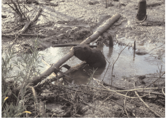
Beaver creating a meal out its preferred winter food.

Shelter is an essential component of any animal's habitat. Beavers create their own shelter in the form of either bank dens or lodges. Dens are created by digging holes in banks of lakes, ponds, rivers, creeks or streams. Dens may collapse when flooded causing beavers to either move and create a new den or patch the holes in the existing den using mud and sticks. Beavers oftentimes will have a series of dens in case one den becomes unsuitable. If the banks are not suitable for digging, beavers will opt to pile up sticks and form a lodge. Entrances to either the den or lodge are positioned underwater but the den itself is usually located 1-2 feet above the water level.