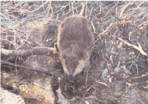
Beaver sitting creekside

Since demand and pelt prices for beaver have subsequently remained relatively low, beavers have thrived and are common statewide. Today, the trapping of beaver in Georgia is limited because of low prices, low fur demand and fewer trappers. In fact, beavers are quite abundant, little trapping pressure exists and there is no closed season on beavers in Georgia.