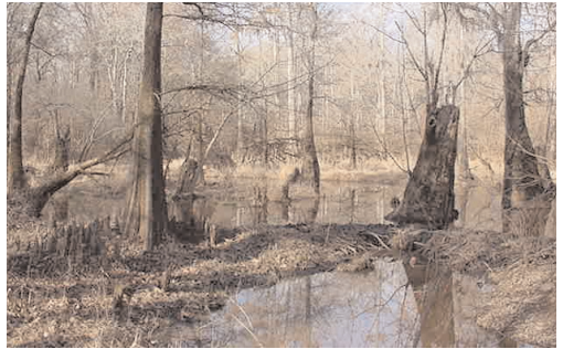
Beaver ponds provide excellent habitat for a host of wildlife species.

From an ecological standpoint, beavers are one of the most important animals in Georgia. Other than man, no animal makes such dramatic landscape changes to the habitat in which they live. Ponds created from beaver dams provide excellent wetland habitat for numerous plants and animals. Beaver ponds are critical habitat for many species of waterfowl and other migratory birds.